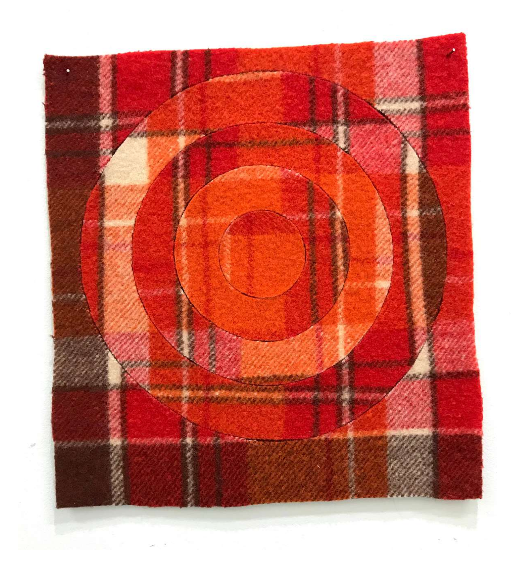
Red red and brown wool, polyester and cotton 18cm x 18cm $250