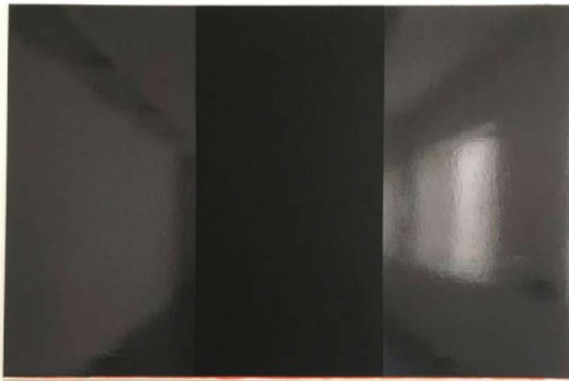
Aaron Martin Interval (Void), 2022 enamel and oil on linen, 113 x 168 cm $2,700