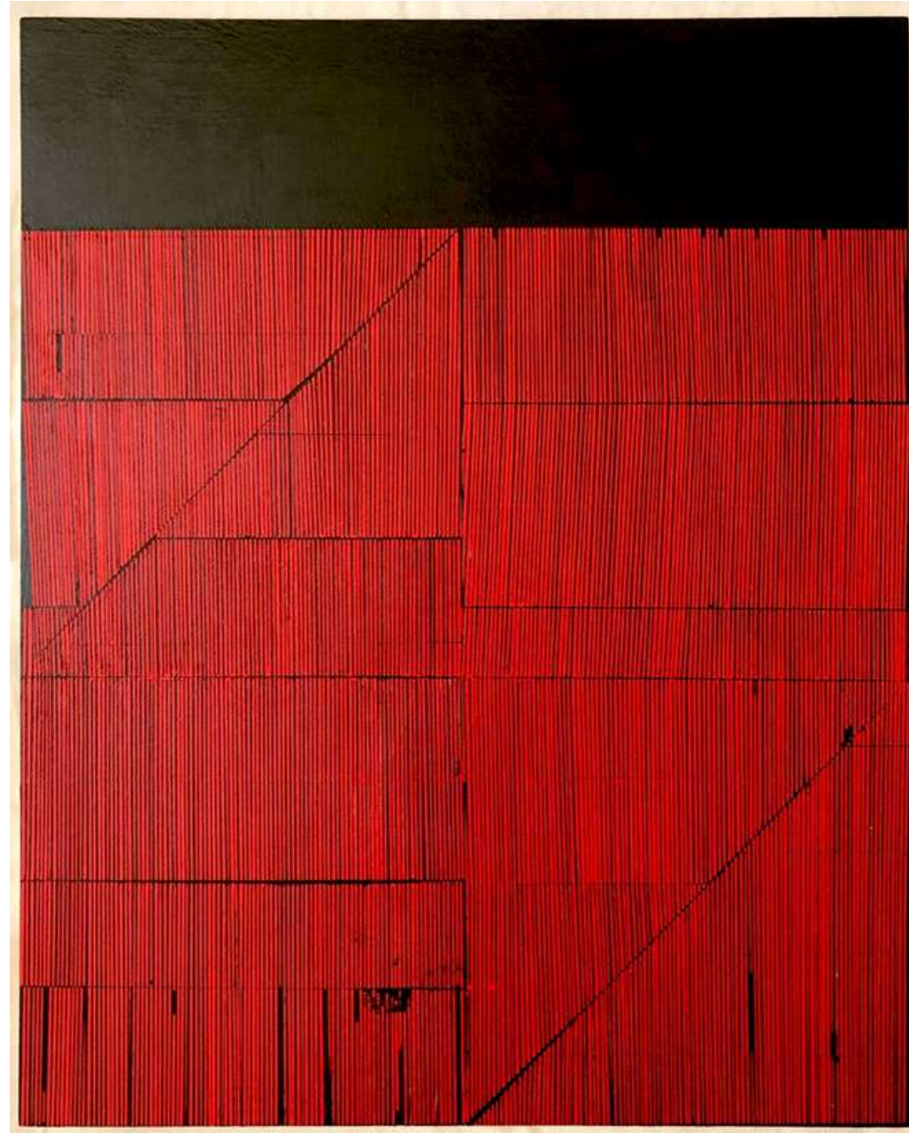
Emma Langridge Cumber, 2021-22 enamel / acrylic on wood 50 x 40cm $1,540