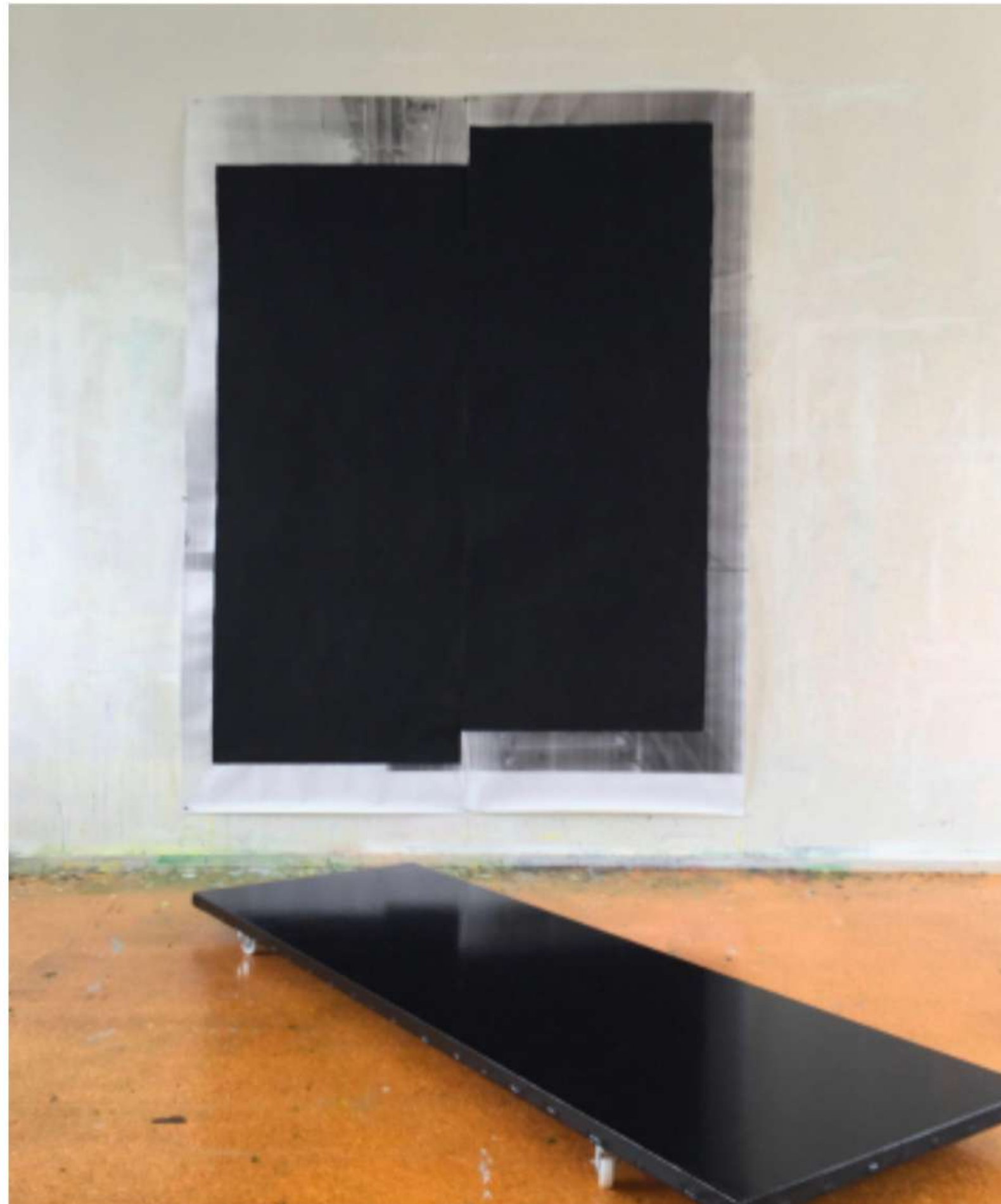
David Thomas Horizontal Reflection Painting/ Movement of Colour (Black) 2020-21 enamel, dust on linen on wheels. 60 cm x 182 cm x 10 cm POA