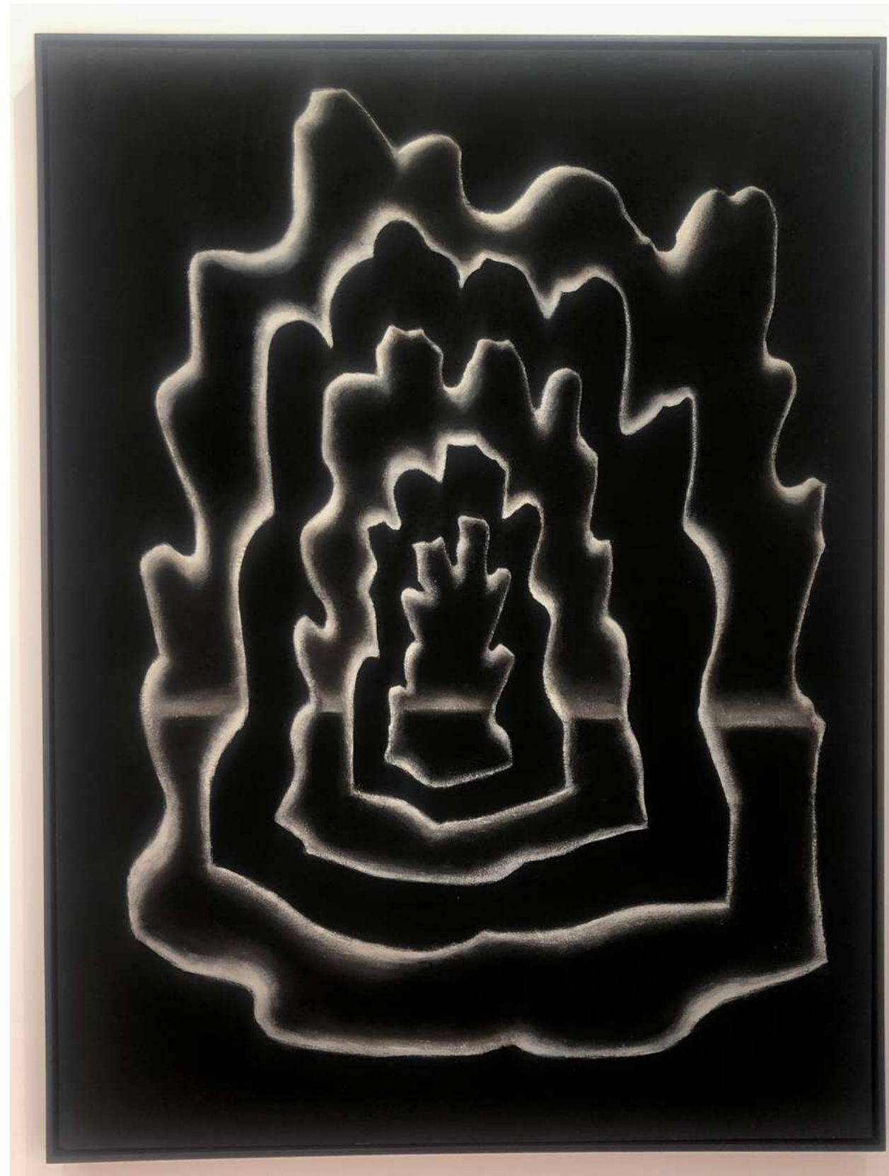
Paul Boston Looking in/ Looking out, 2012 acrylic on board, 120 x 90 cm POA