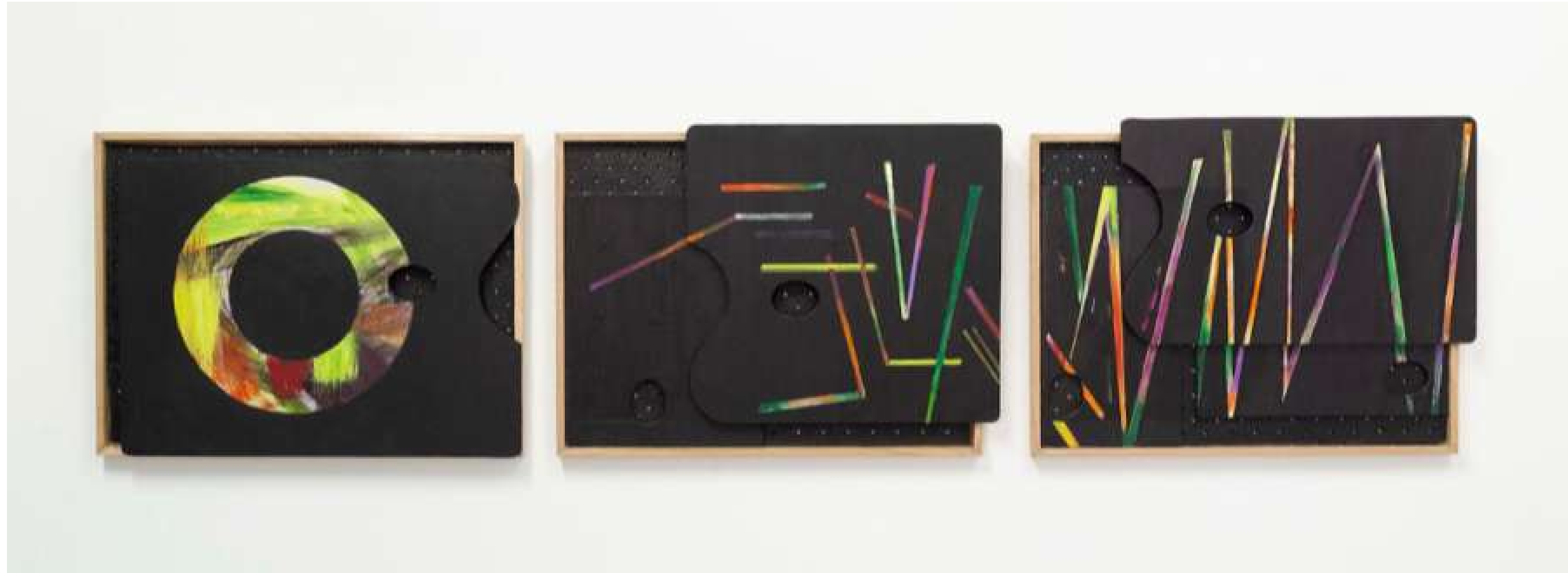
Elisabeth Bodey The Colour of Noise (go-between series), 2022 acrylic, charcoal on palettes on board (triptych) POA