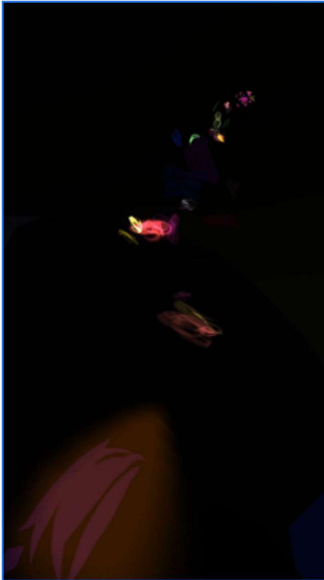
David Harley Naples Black, 2022 Moving Painting video resolution 3840x2160 Duration: 17 minutes POA