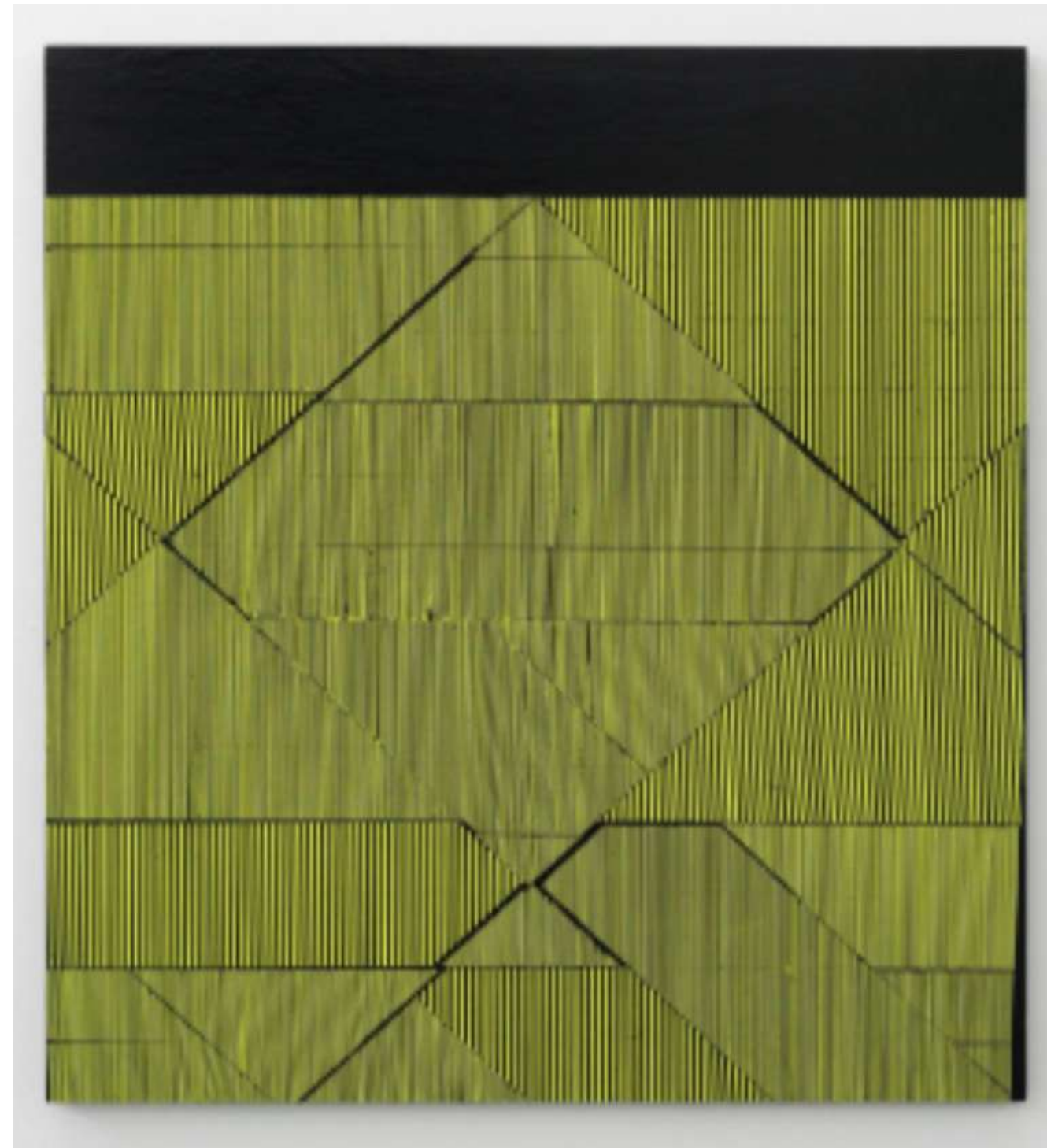
Emma Langridge Tocsin, 2019 enamel / acrylic on wood 70 x 60cm $3,300