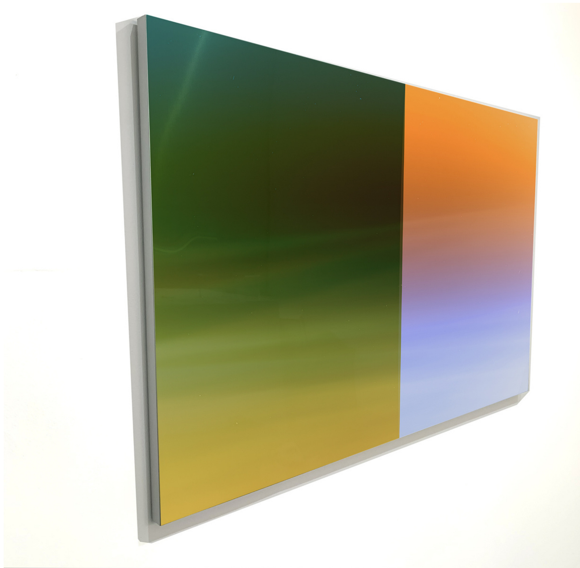
Spin into Being, 2022 digital pinhole image on aluminium 850 x 1230mm, Edition of 5, Edition #1 $4,000