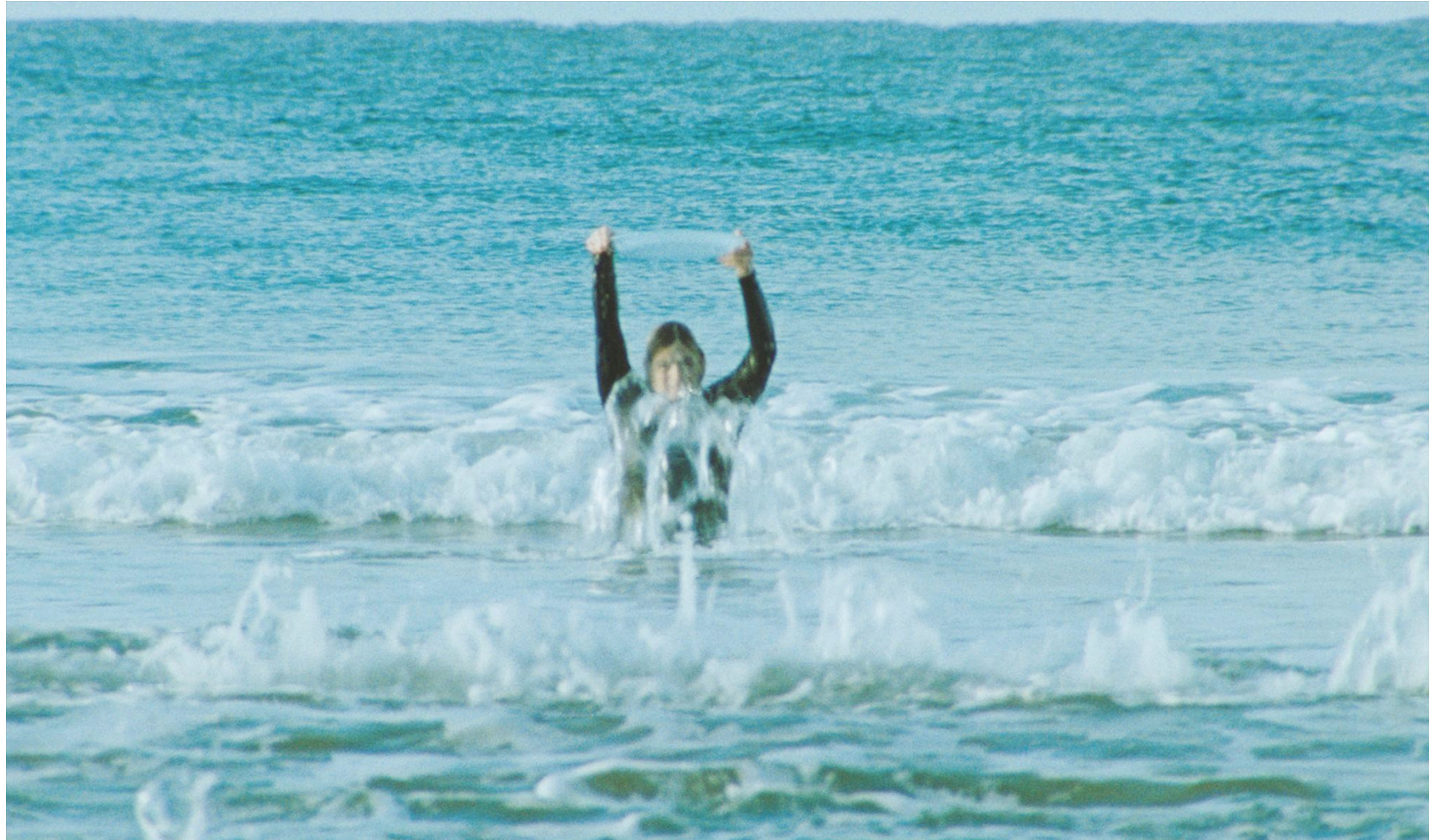
Light Spin, 2022 Installation: HD digital video from 16mm film, window film dimensions variable $N/A