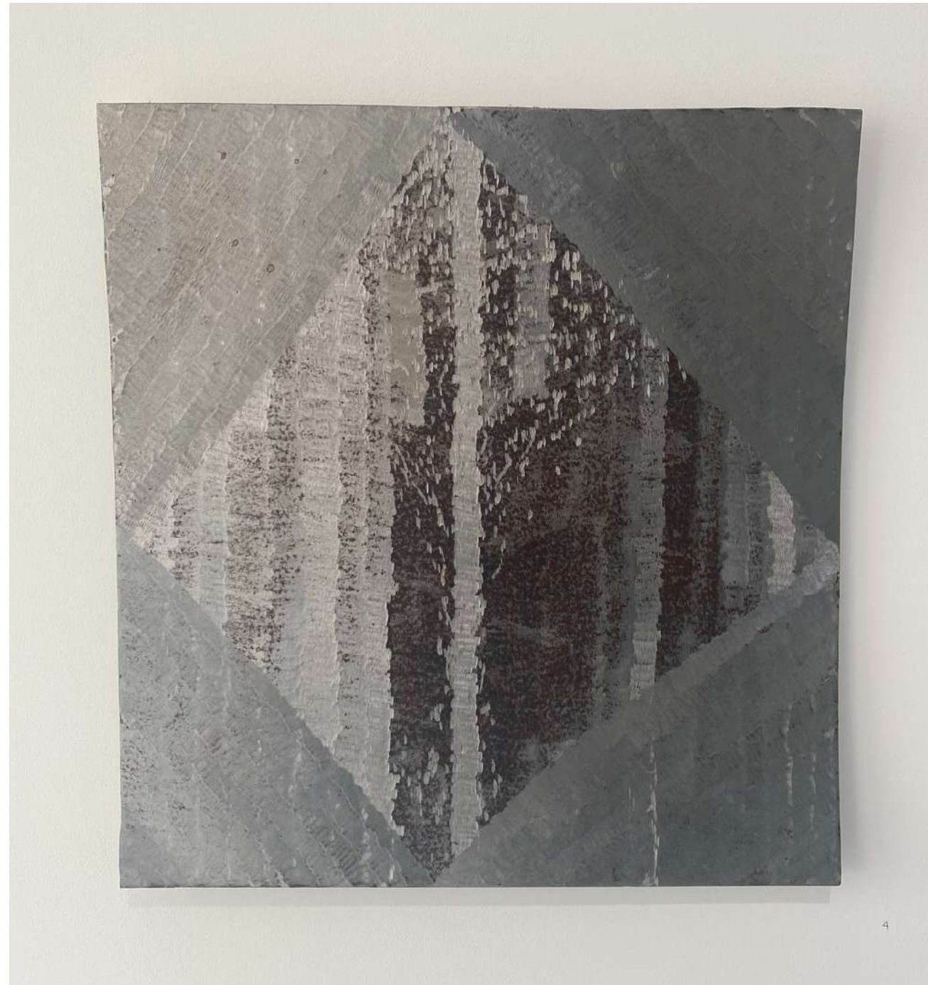
Erased Drawing #4 2022 Steel 570 x 600 cm SOLD