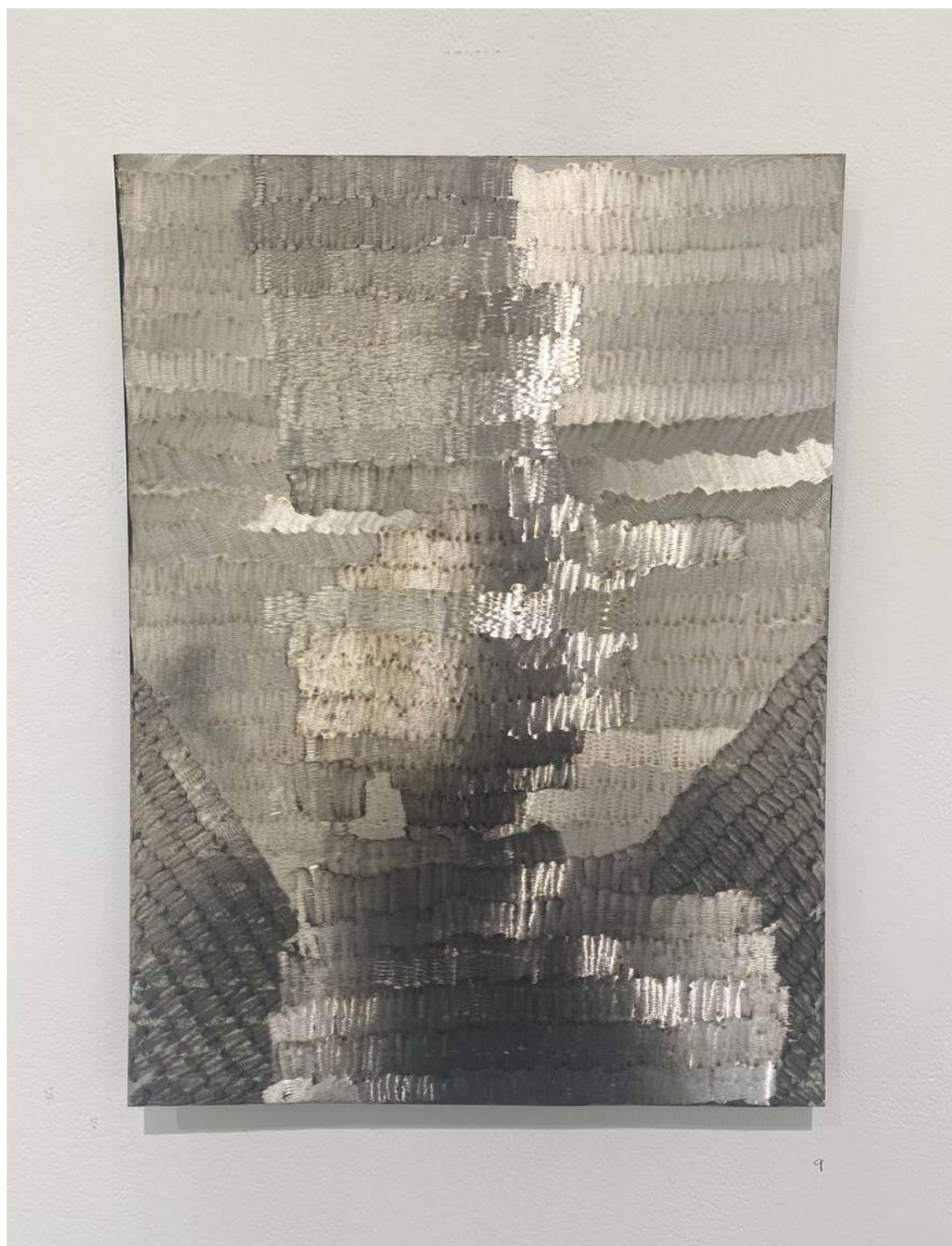
Erased Drawing #9 2022 Steel 330 x 440 cm $800