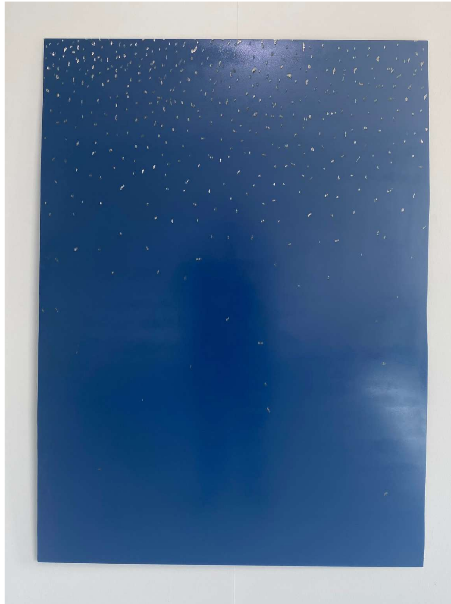
Erased Drawing #1 2022 Steel 900 x 1230 cm SOLD