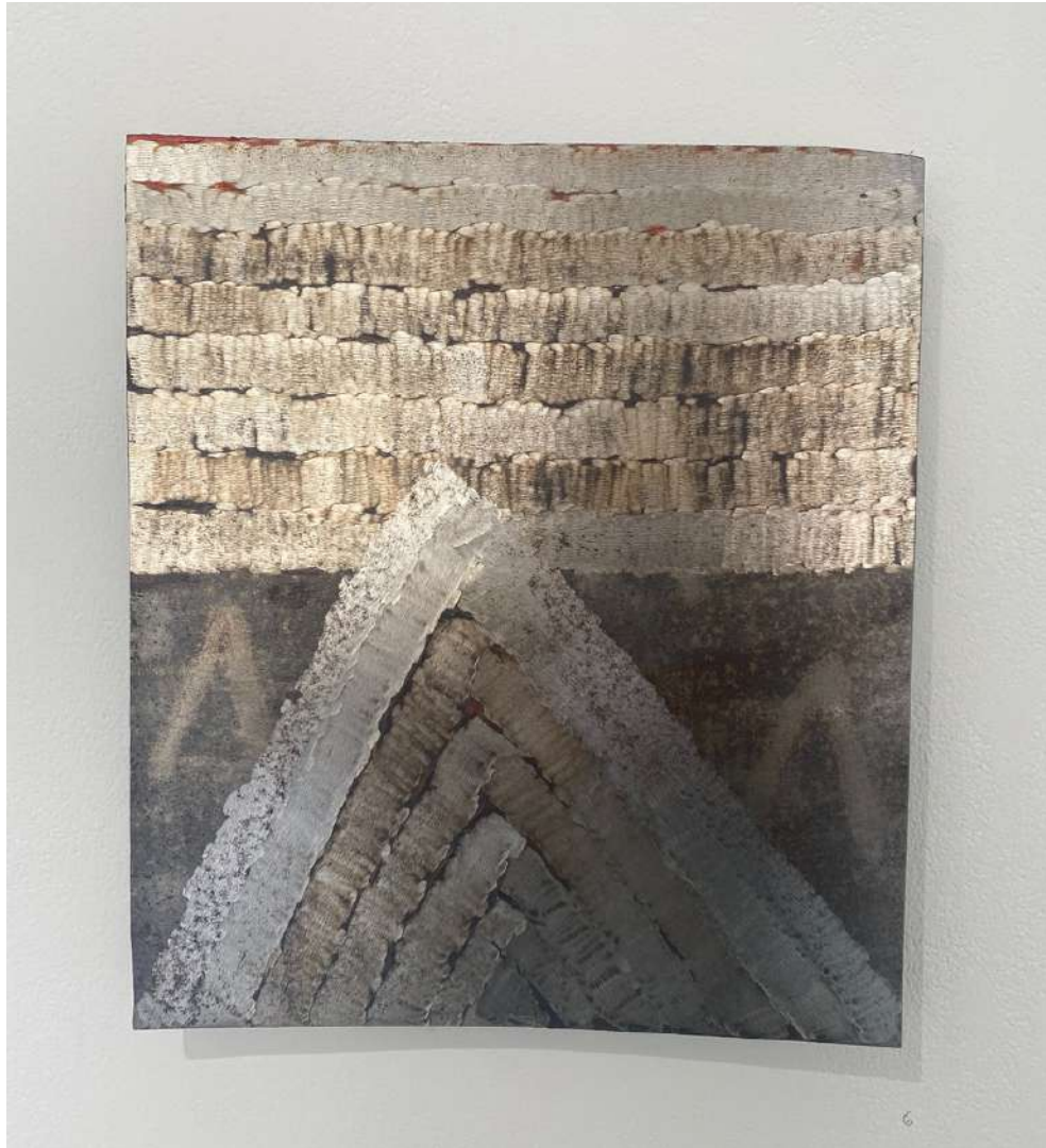
Erased Drawing #6 2022 Steel 300 x 340 cm SOLD