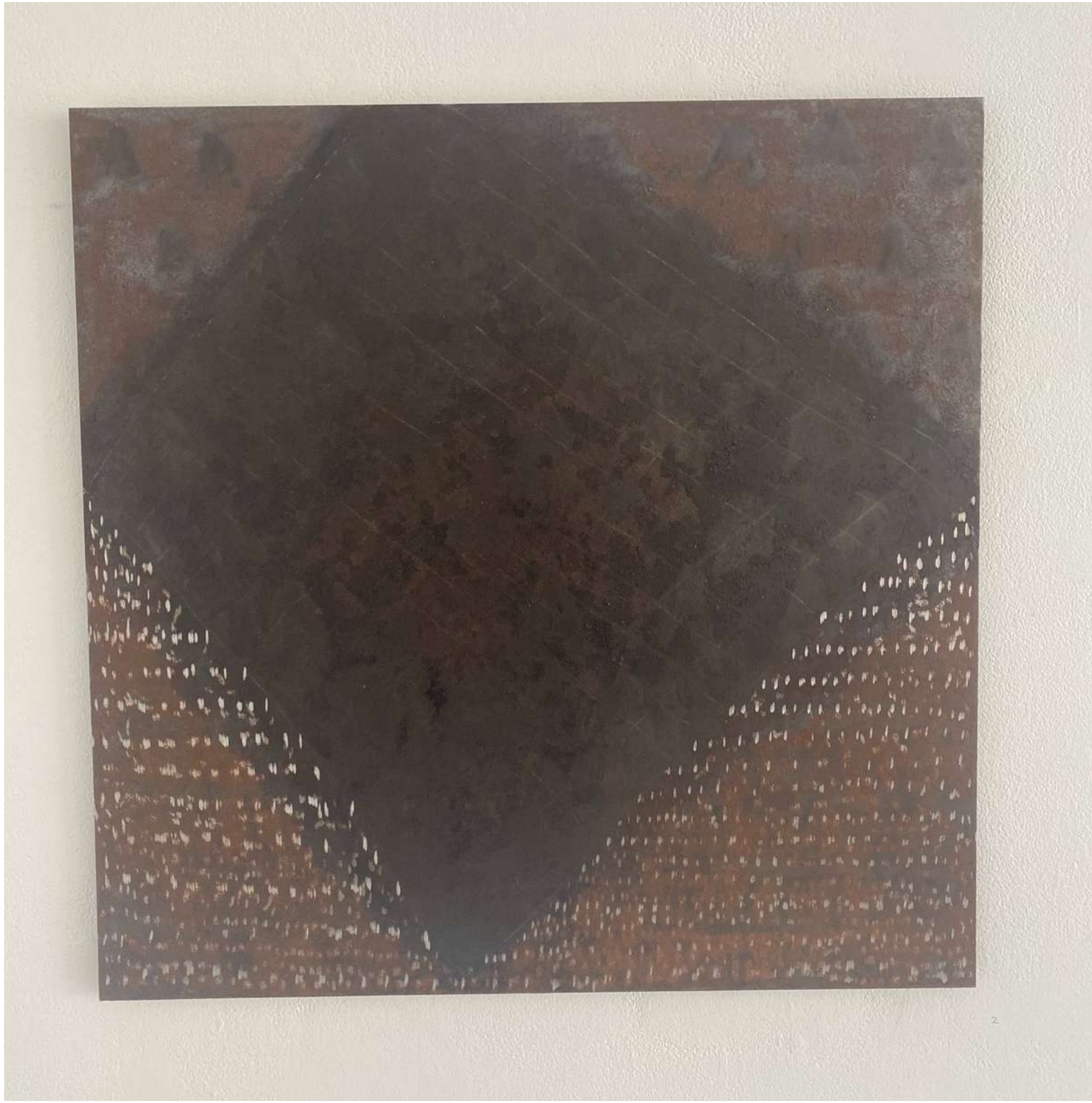
Erased Drawing #2 2022 Steel 600 x 600 cm $1200