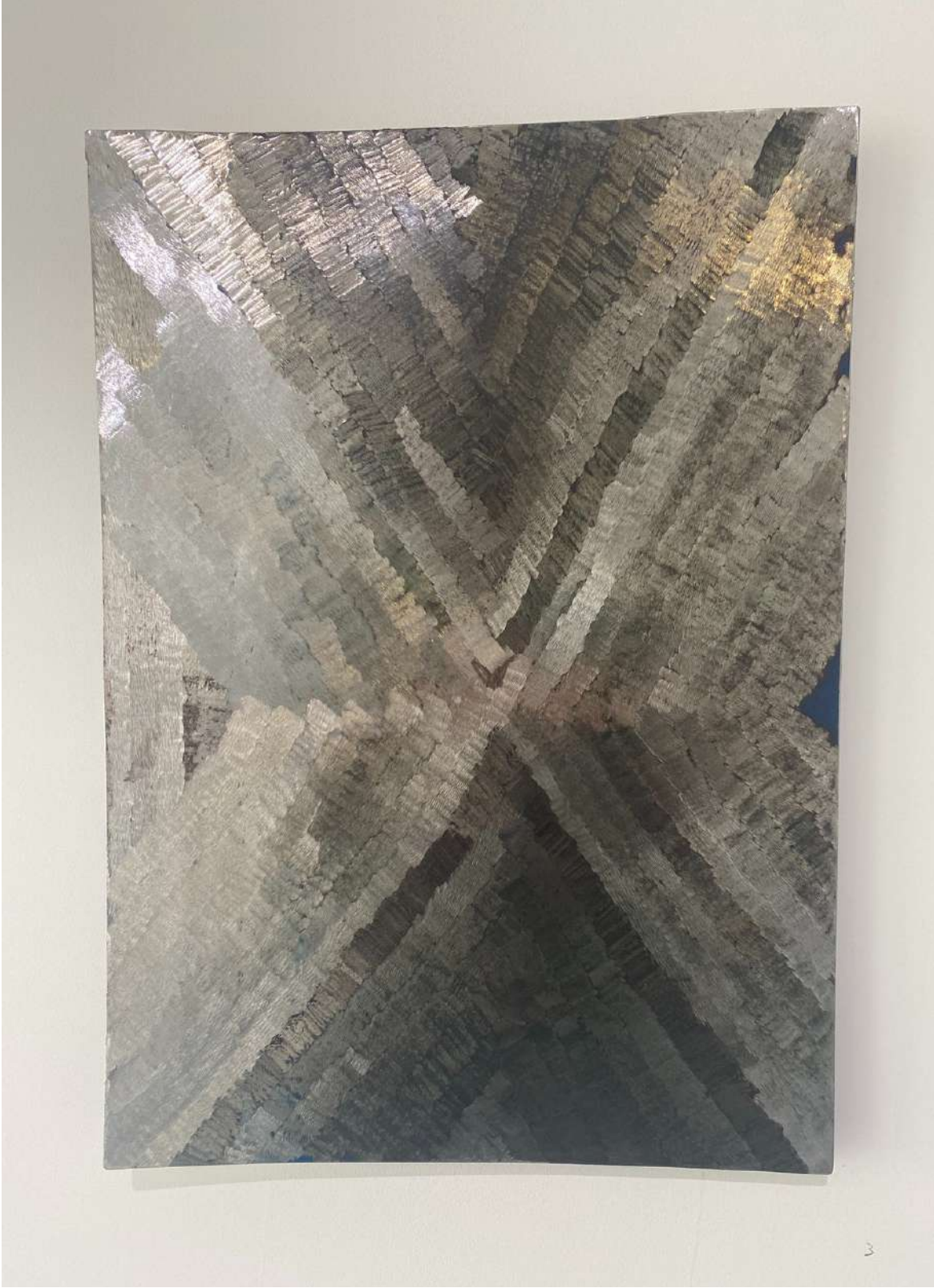
Erased Drawing #3 2022 Steel 420 x 600 cm $1200