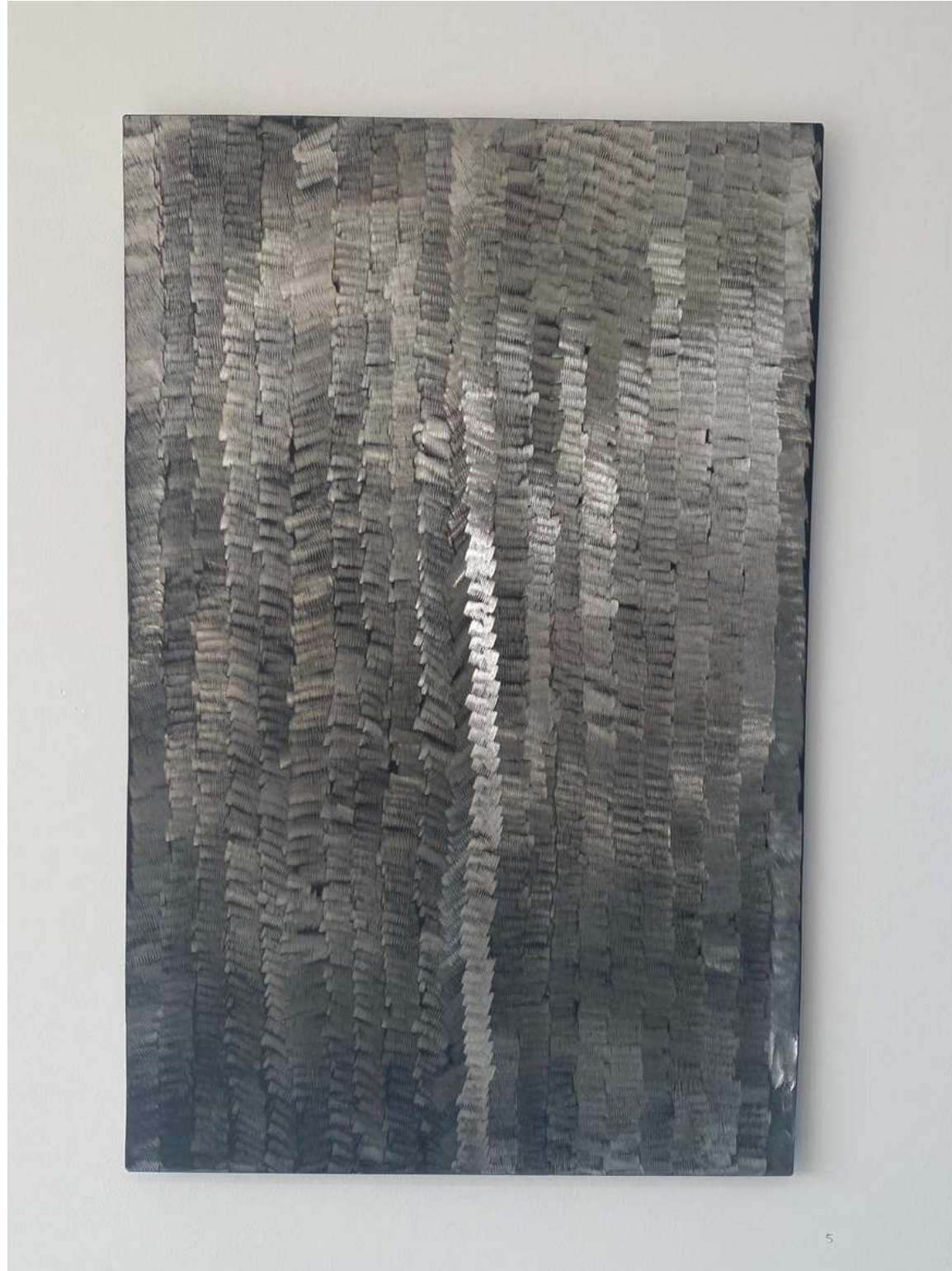
Erased Drawing #5 2022 Steel 410 x 630 cm $1200