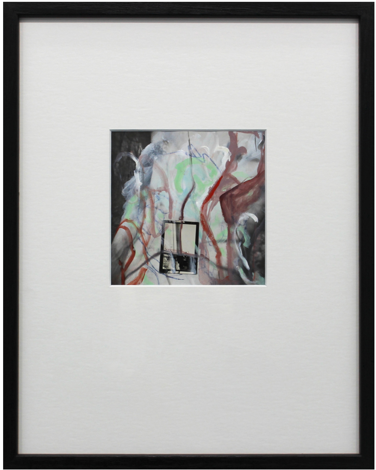
Study #5 2022 mix media collage 28 x 35.6cm framed $300