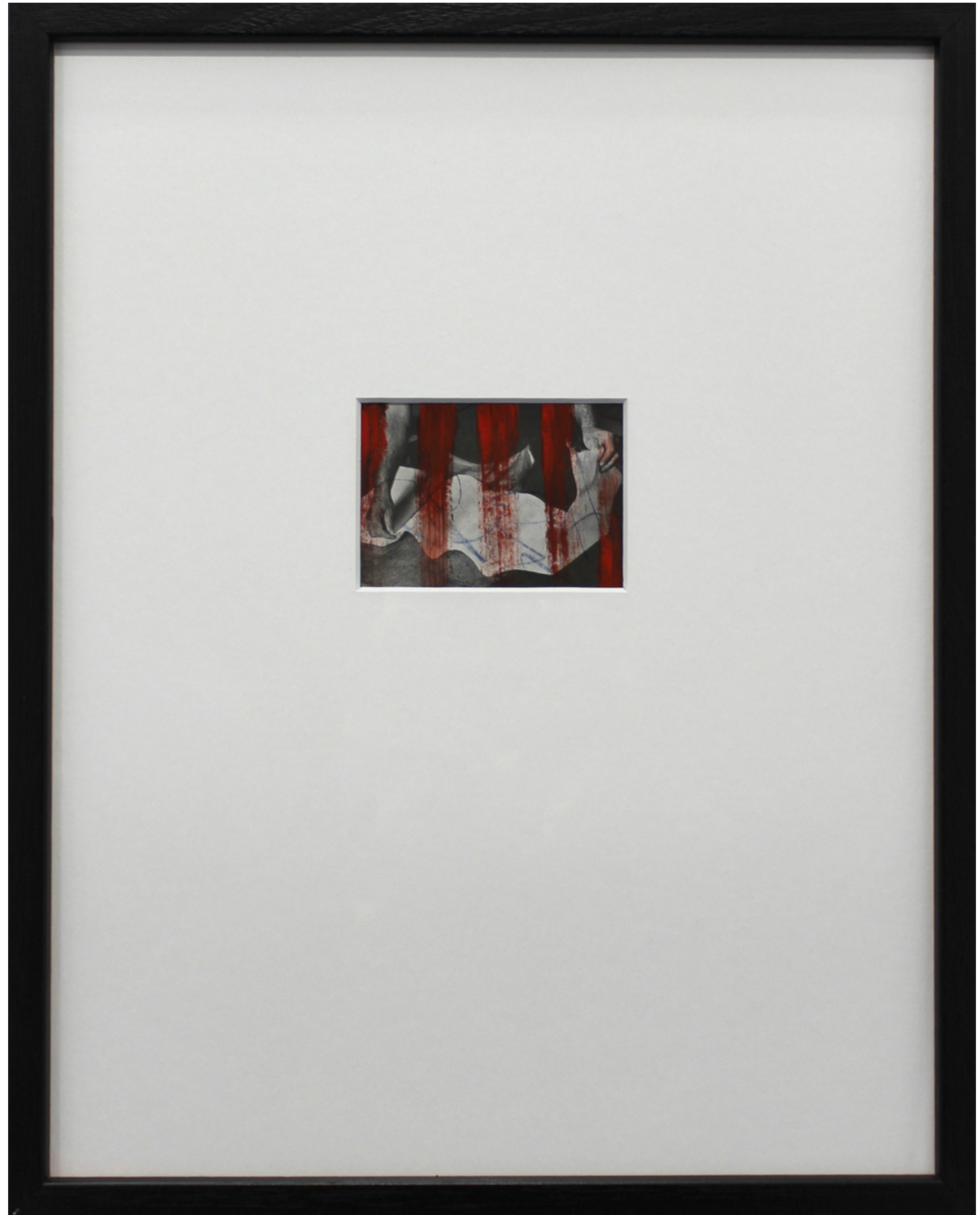
Study #8 2022 mix media collage 28 x 35.6cm framed $300