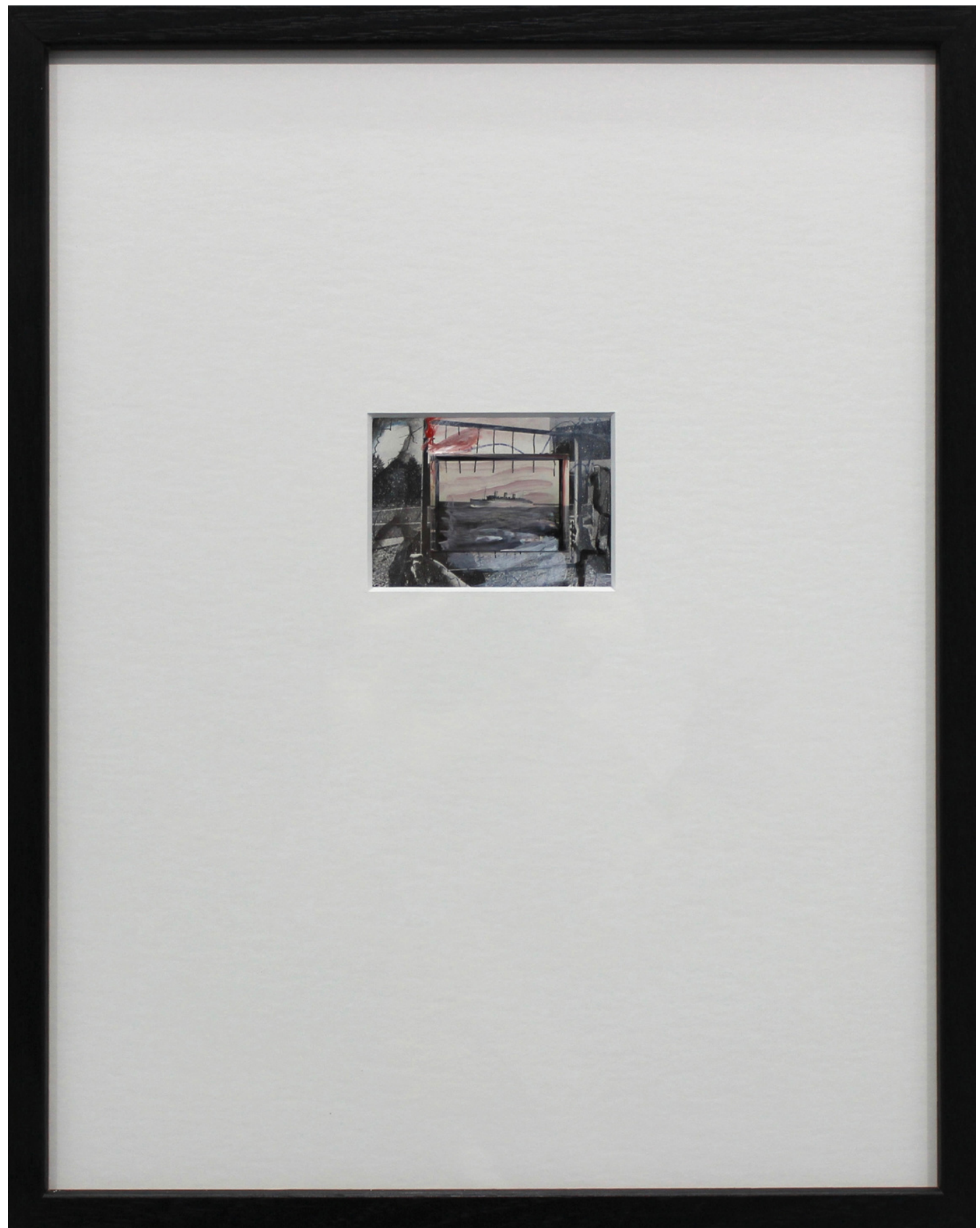
Study #9 2022 mix media collage 28 x 35.6cm framed $300