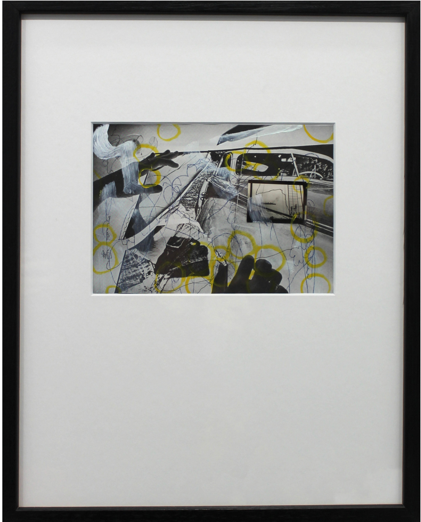
Study #4 2022 mix media collage 28 x 35.6cm framed $350