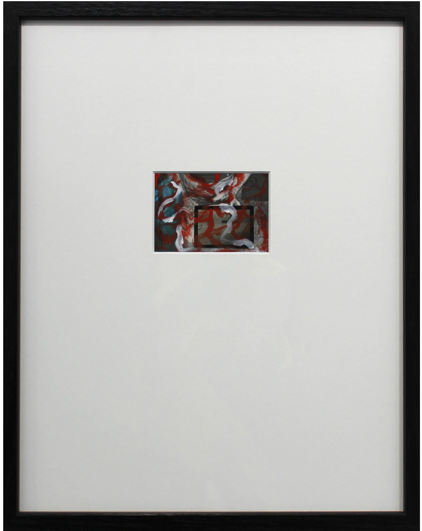
Study #1 2022 mix media collage 28 x 35.6cm framed $300