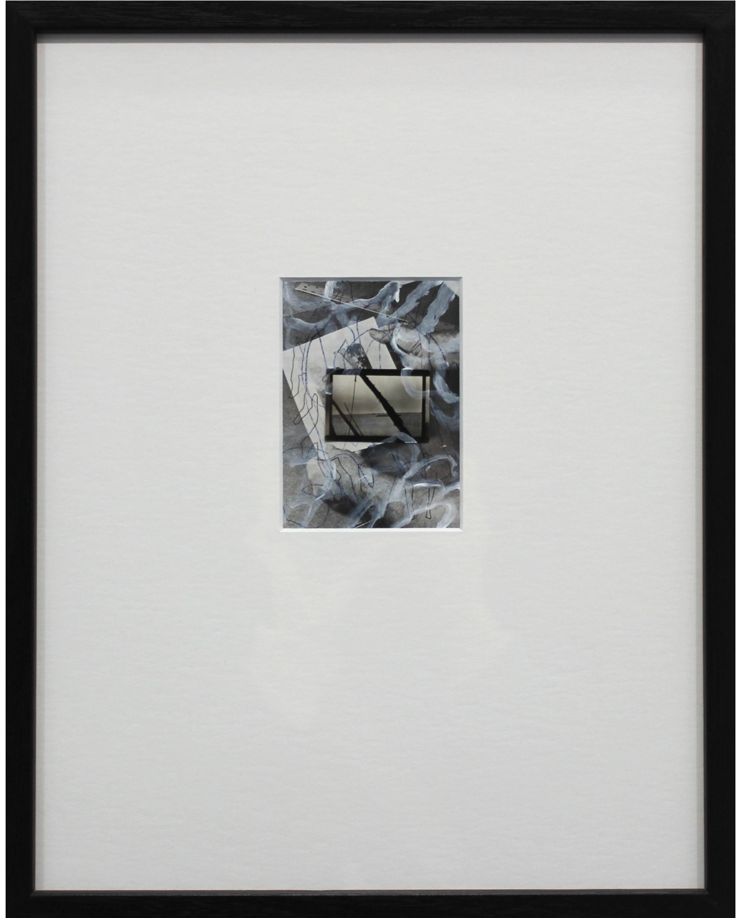
Study #3 2022 mix media collage 28 x 35.6cm framed $350