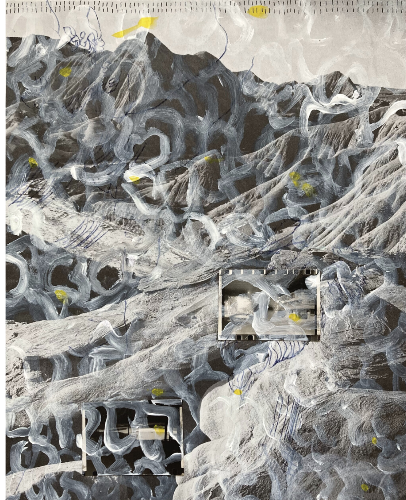
Study #6 2022 mix media collage 28 x 35.6cm framed $380