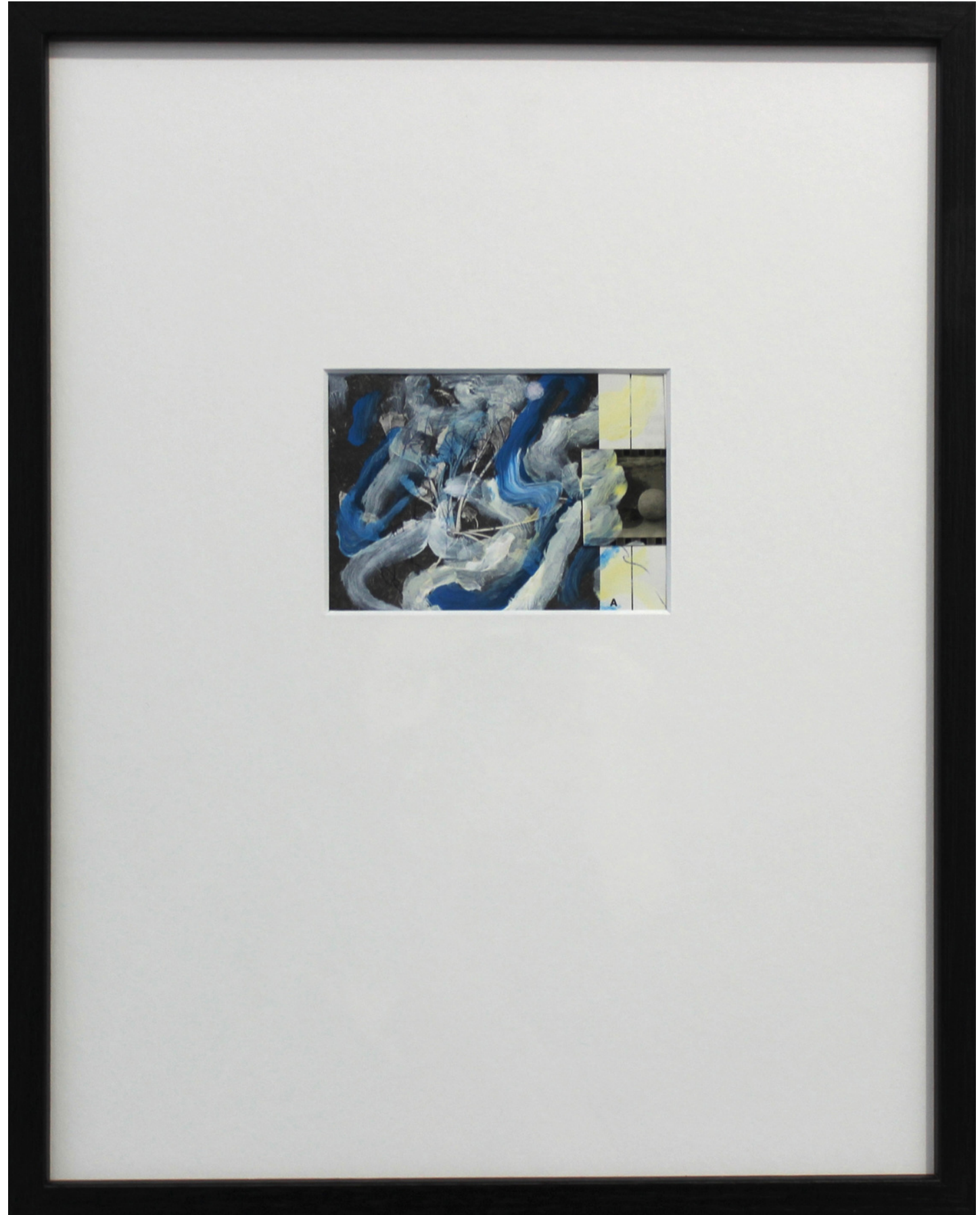
Study #2 2022 mix media collage 28 x 35.6cm framed $330