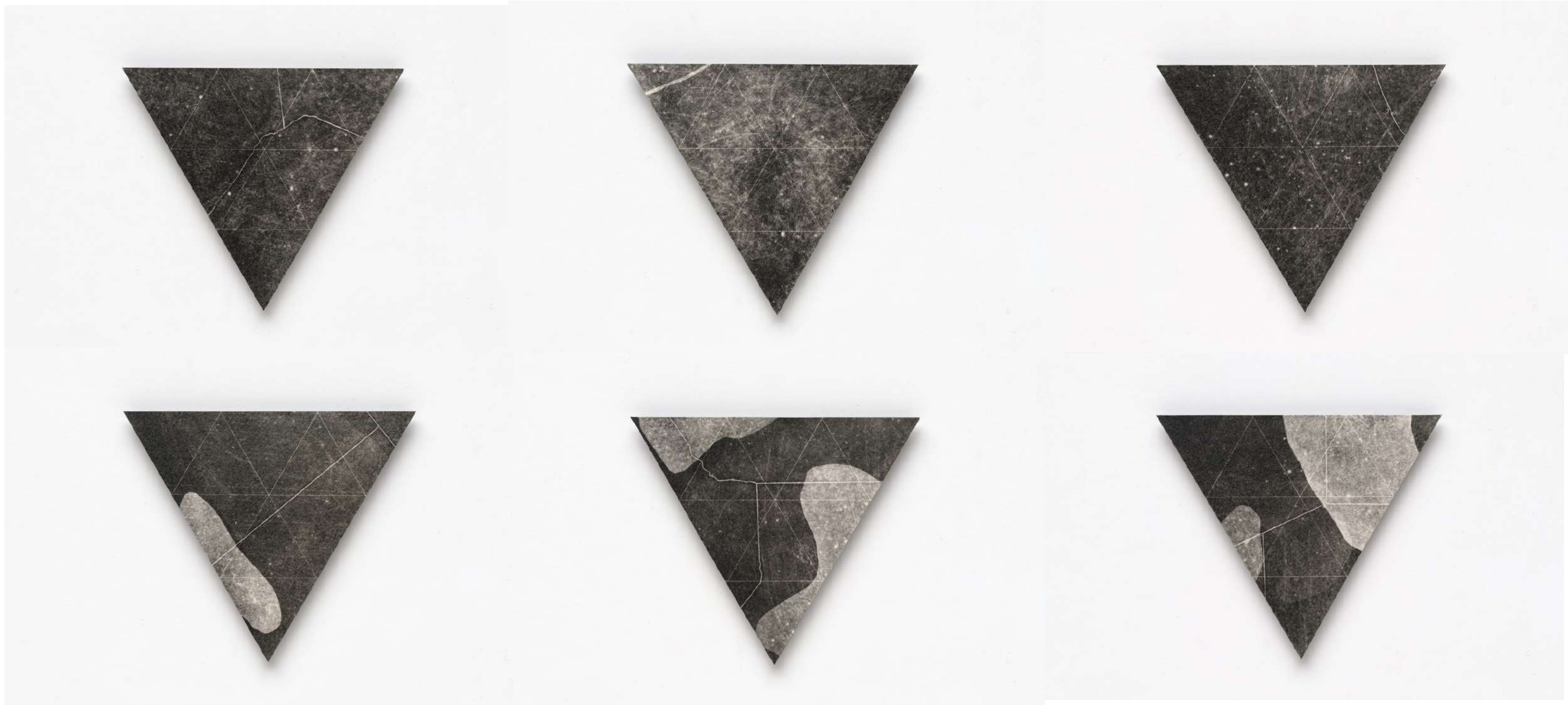
Aerial Notes, 2020-2021 hand-printed photograms on cotton rag photographic paper each 12.5cm x 14.5cm installation approximately 1.1 Full set of 216: $10,800 Each: $75