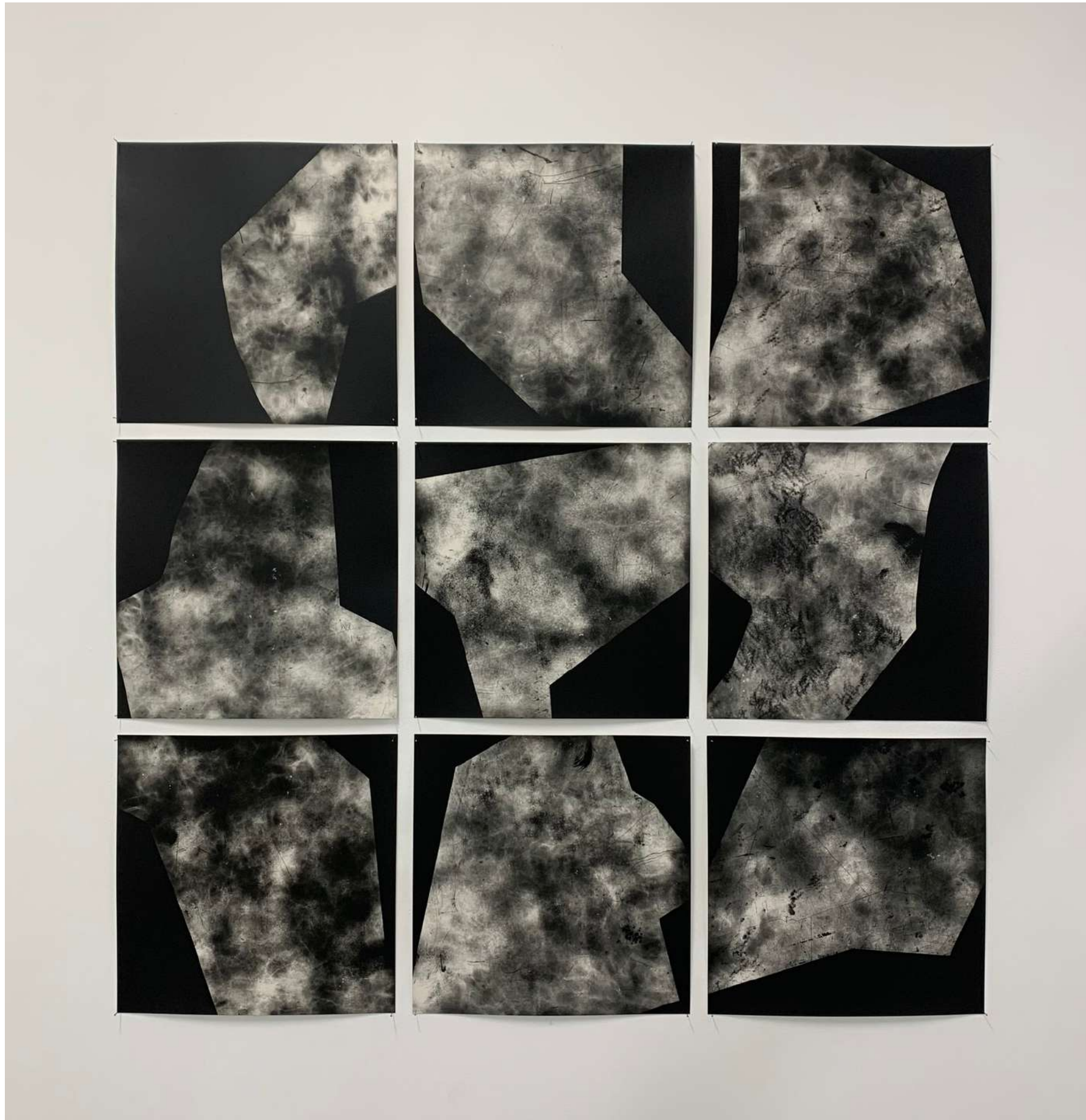
Dual, 2021-2022 hand-printed photograms on cotton rag photographic paper each 40.3cm x 40.3cm installation approximately 1.26m x 1.26m Each: $375