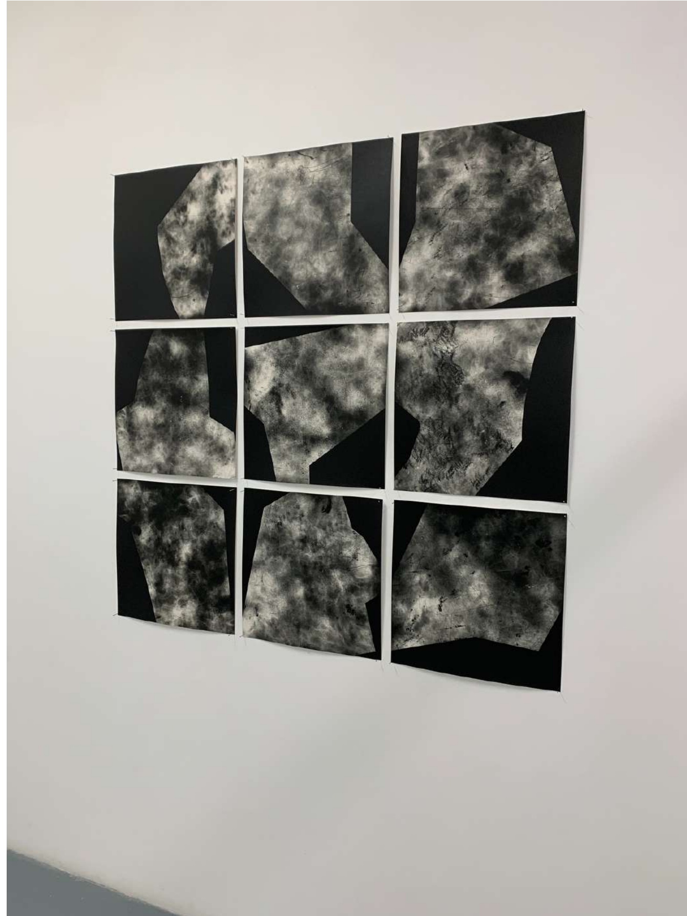
Dual, 2021-2022 hand-printed photograms on cotton rag photographic paper each 40.3cm x 40.3cm installation approximately 1.26m x 1.26m Each: $375