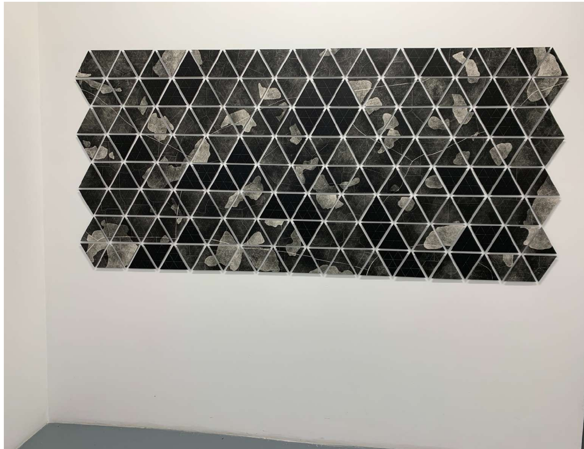
Aerial Notes, 2020-2021 hand-printed photograms on cotton rag photographic paper each 12.5cm x 14.5cm installation approximately 1.1 Full set of 216: $10,800 Each: $75