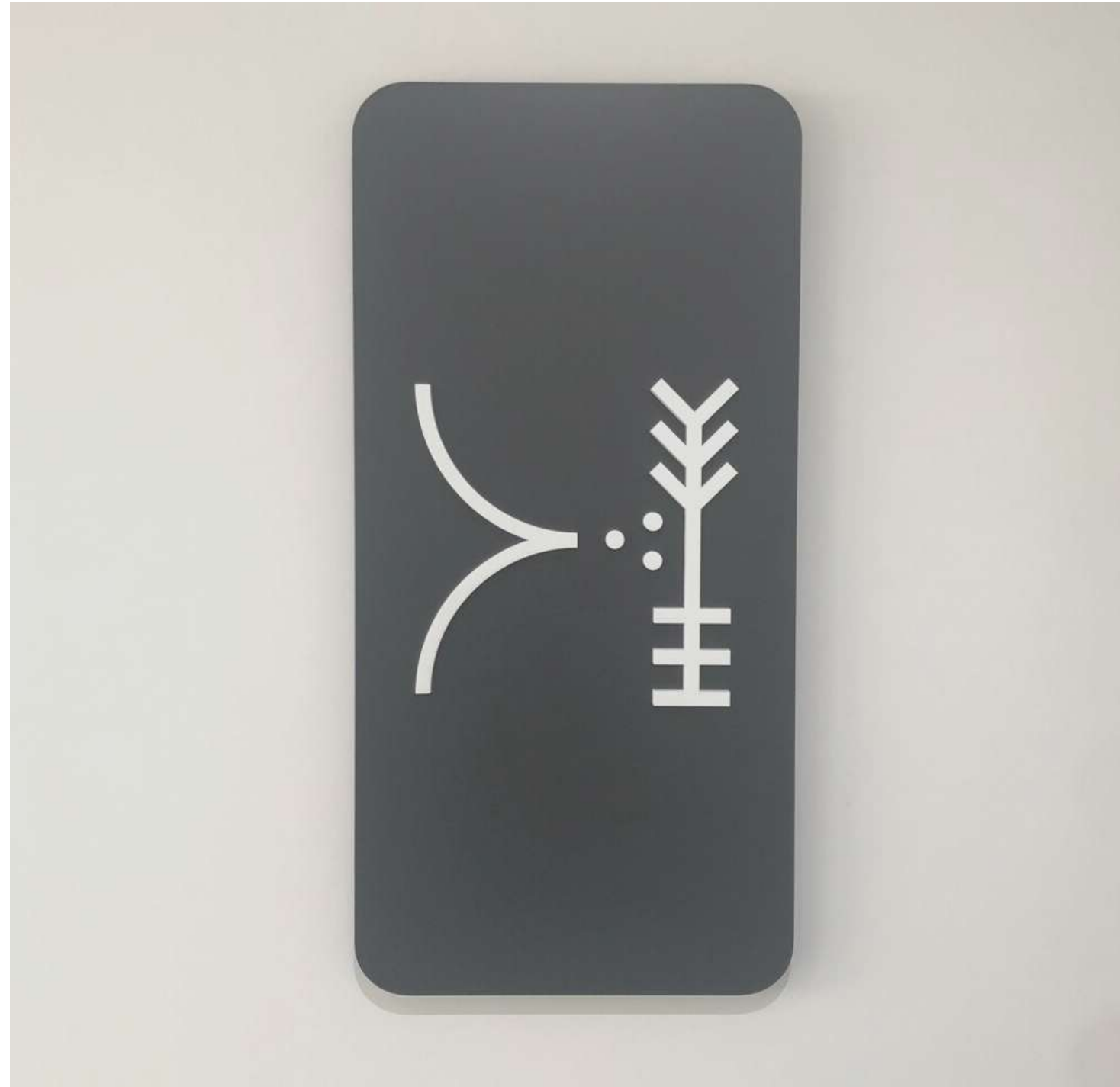
A nomadic way of being, searching for greener pastures 2022 painted laser cut opal acrylic on painted aluminium 892 x 435mm $960