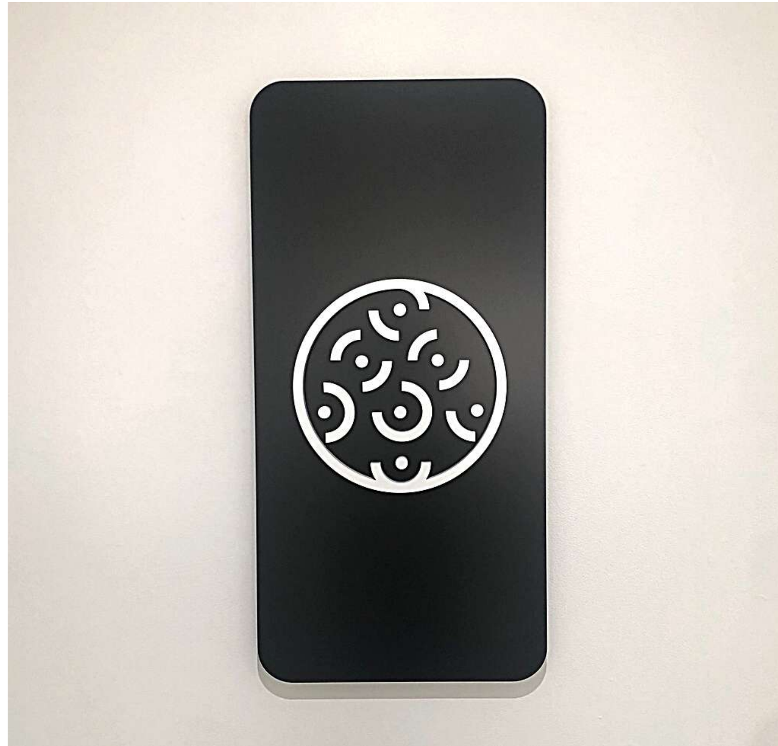
Respect for the Law of the Land, 2022 painted laser cut opal acrylic on painted aluminium 892 x 435mm $960