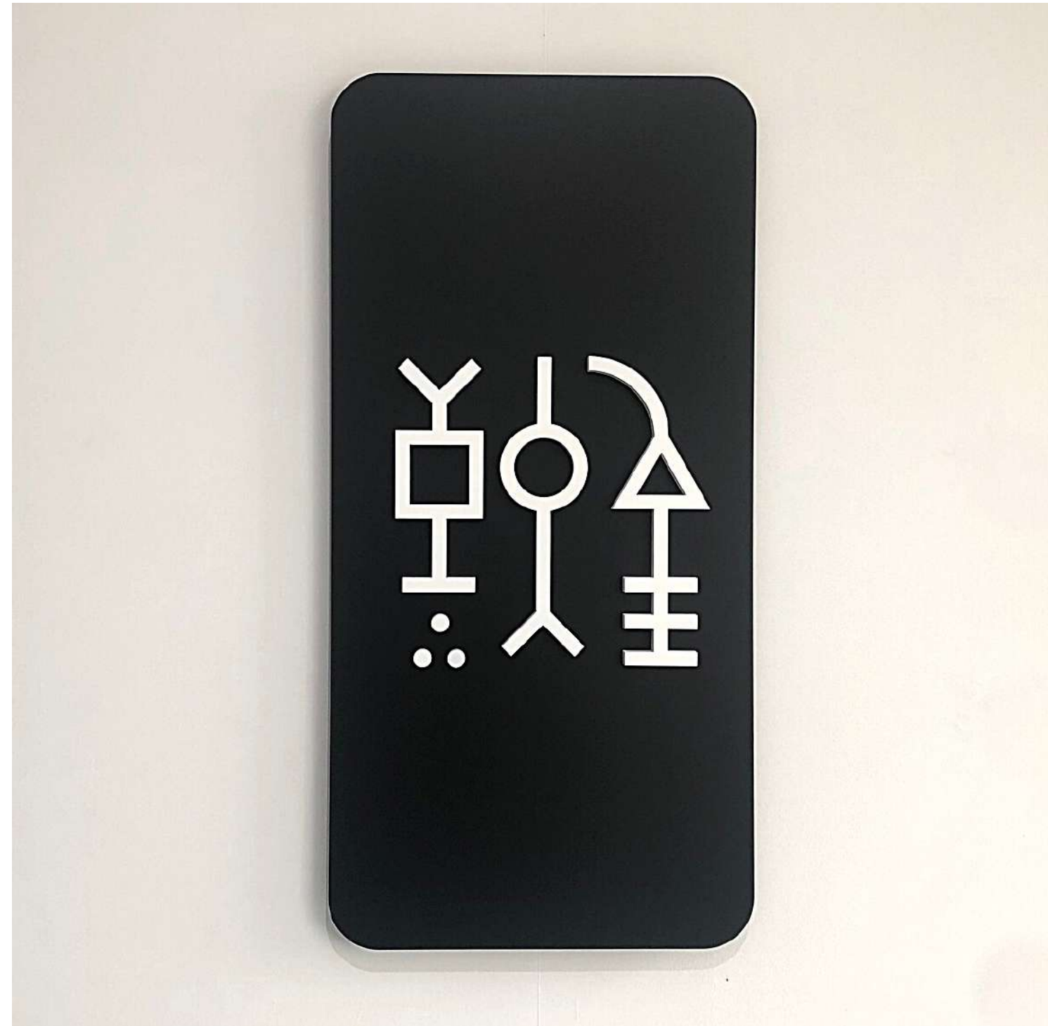
We are together, 2022 painted laser cut opal acrylic on painted aluminium 892 x 435mm $960