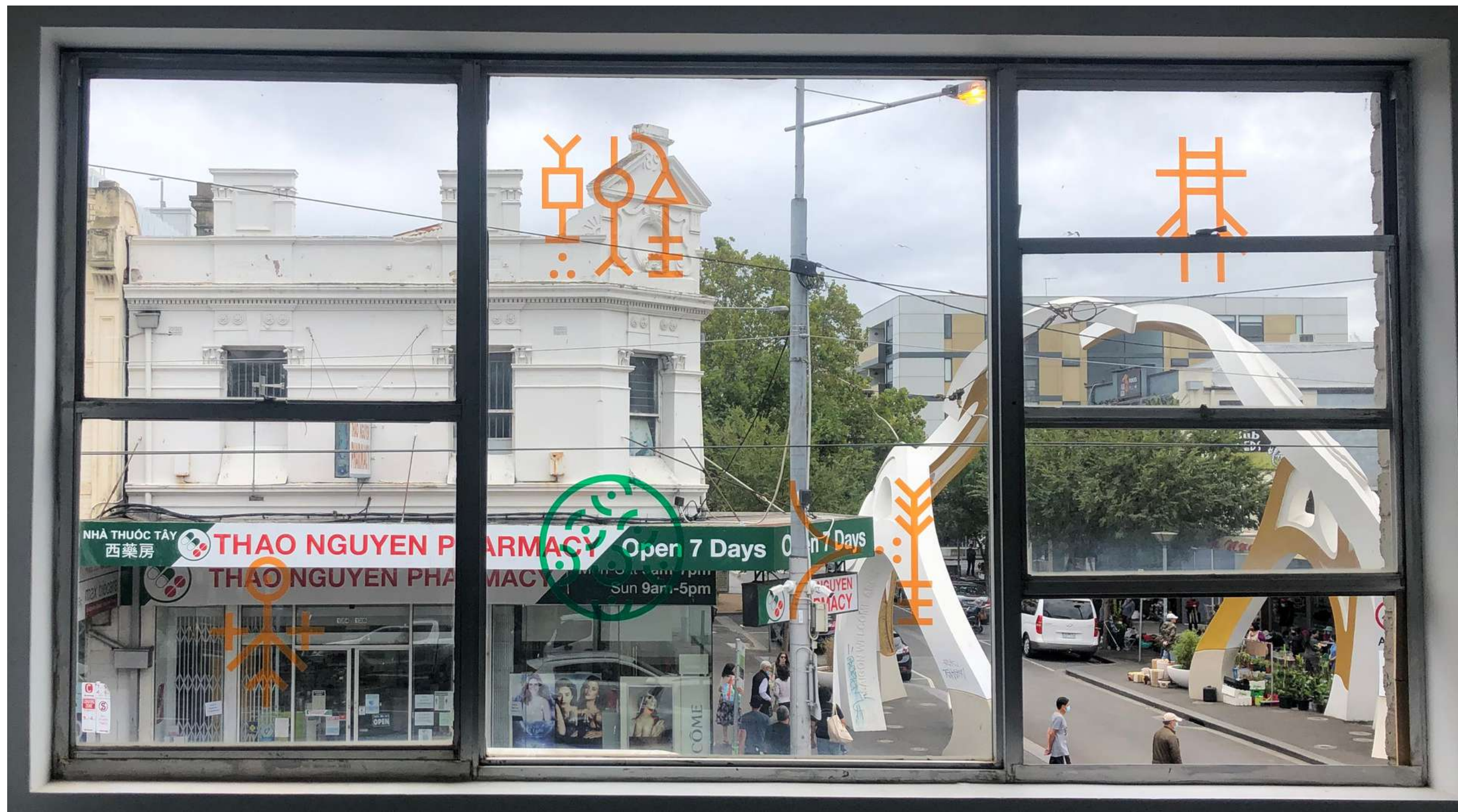
Future loop, 2022 transparent self-adhesive vinyl, dimensions variable (on window) POA