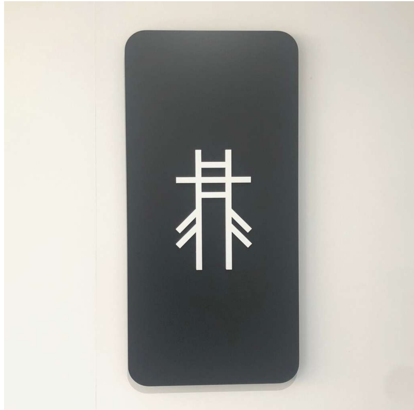
Going out to play, 2022 painted laser cut opal acrylic on painted aluminium 892 x 435mm $960