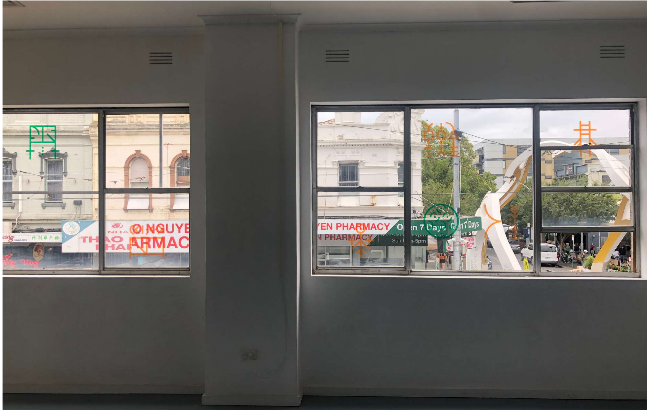
Future loop, 2022 transparent self-adhesive vinyl, dimensions variable (on window) POA