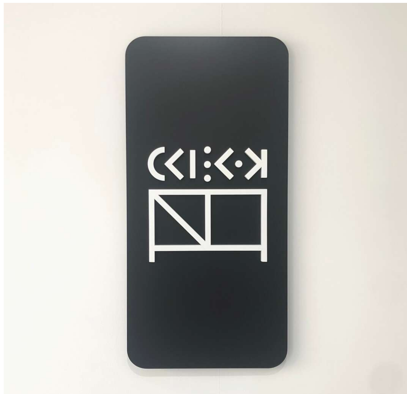
The place of connection, 2022 painted laser cut opal acrylic on painted aluminium 892 x 435mm $960