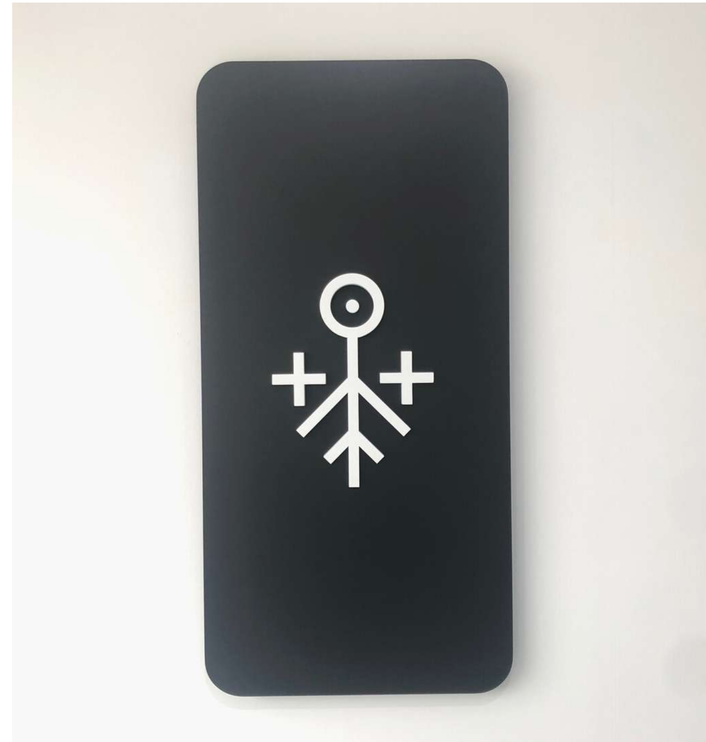
To flirt by playfully fishing for compliments, 2022 painted laser cut opal acrylic on painted aluminium 892 x 435mm $960