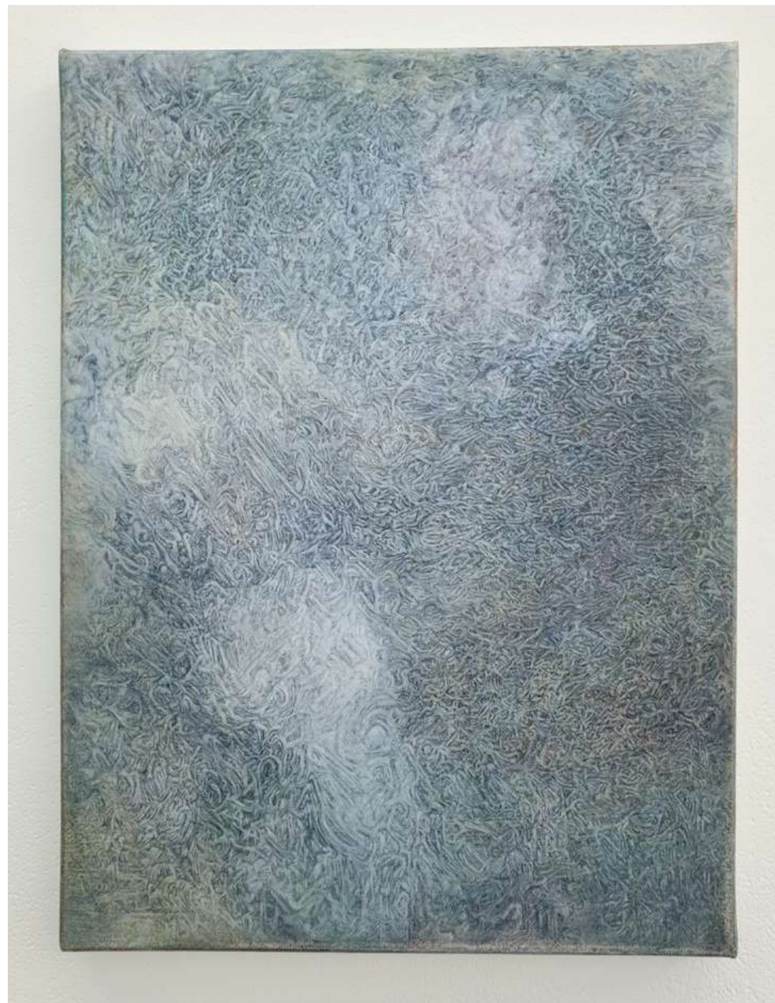
01_003 2021 oil on linen 40cm x 30cm $1100