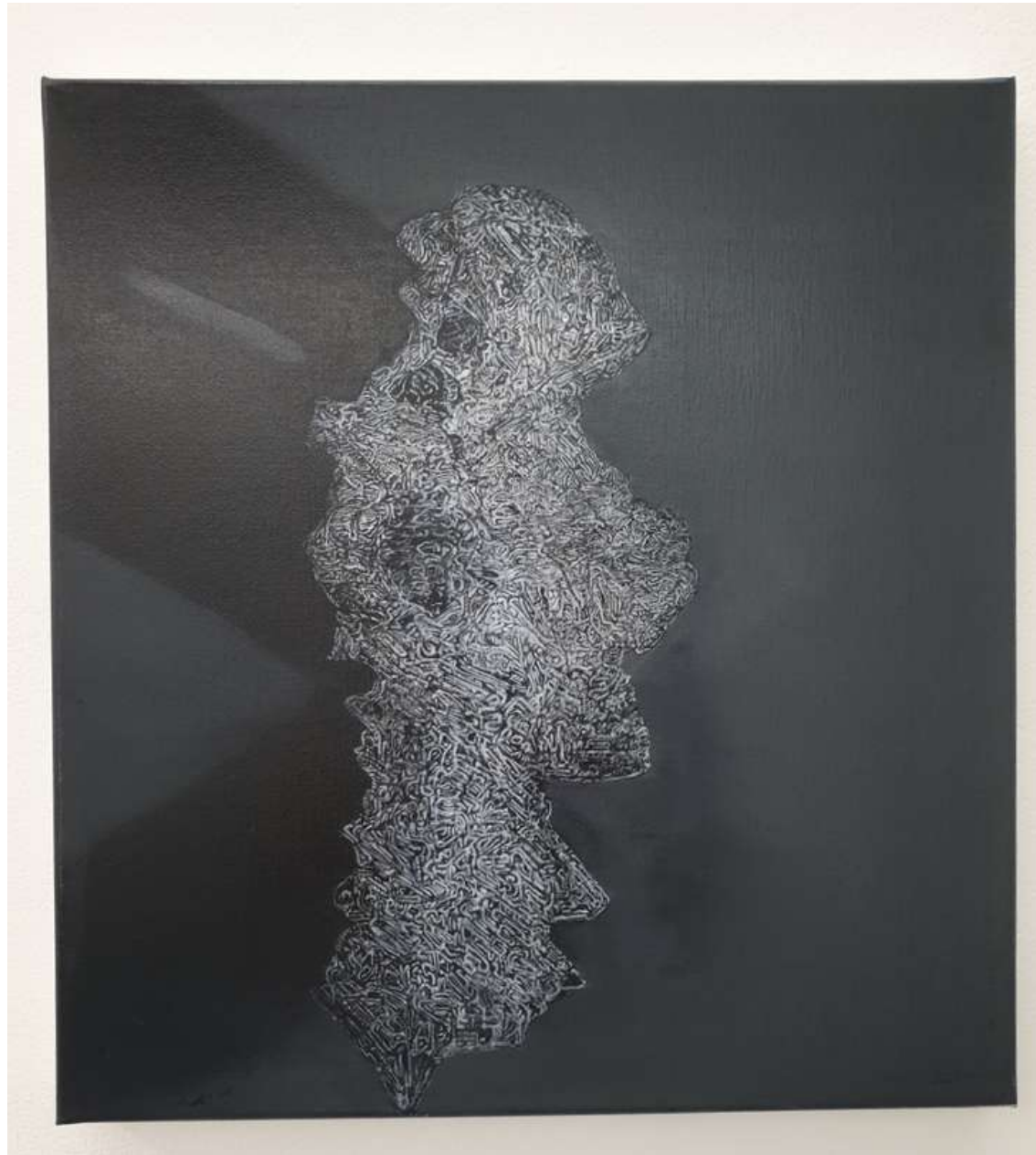
01_006 2022 oil on linen 35cm x 30cm $900