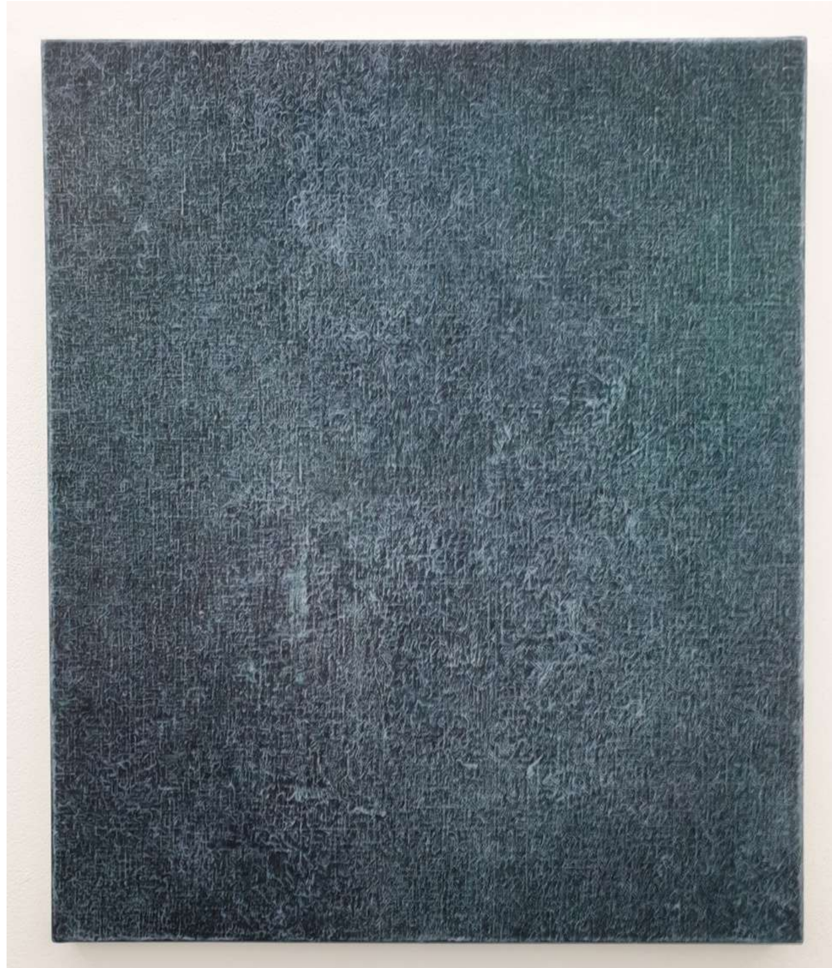
01_002 2020 oil on linen 55cm x 65cm $3400