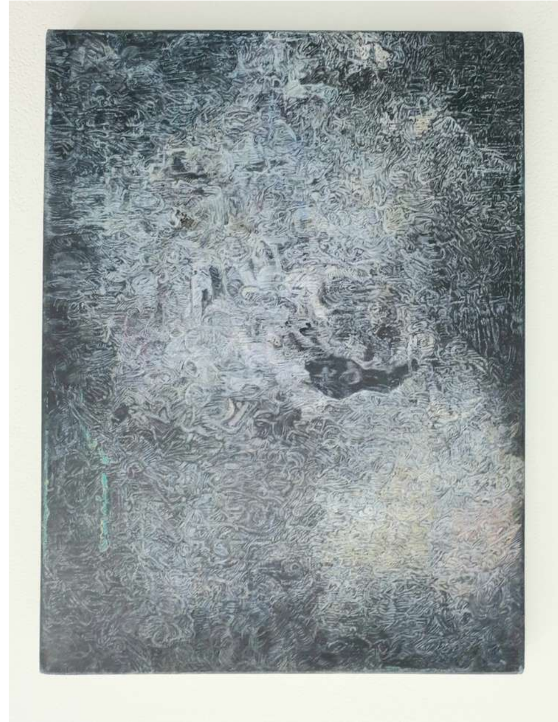
01_004 2021 oil on linen 40cm x 30cm $1100