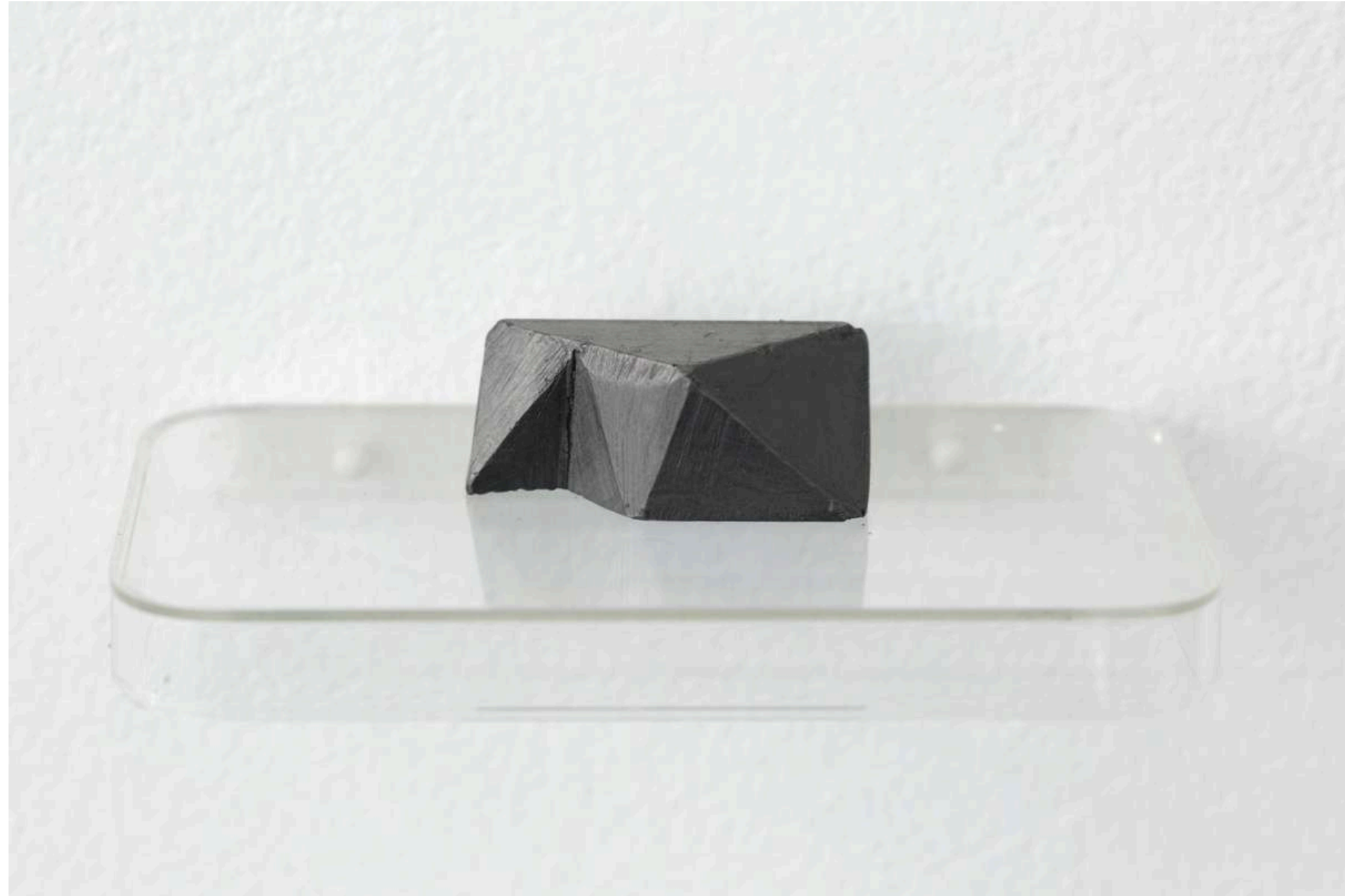
CITÉ STUDIO FORM #2 2019 carved graphite stick on found acrylic box object only 1.5 x 3.7 x 1.5 cm NFS