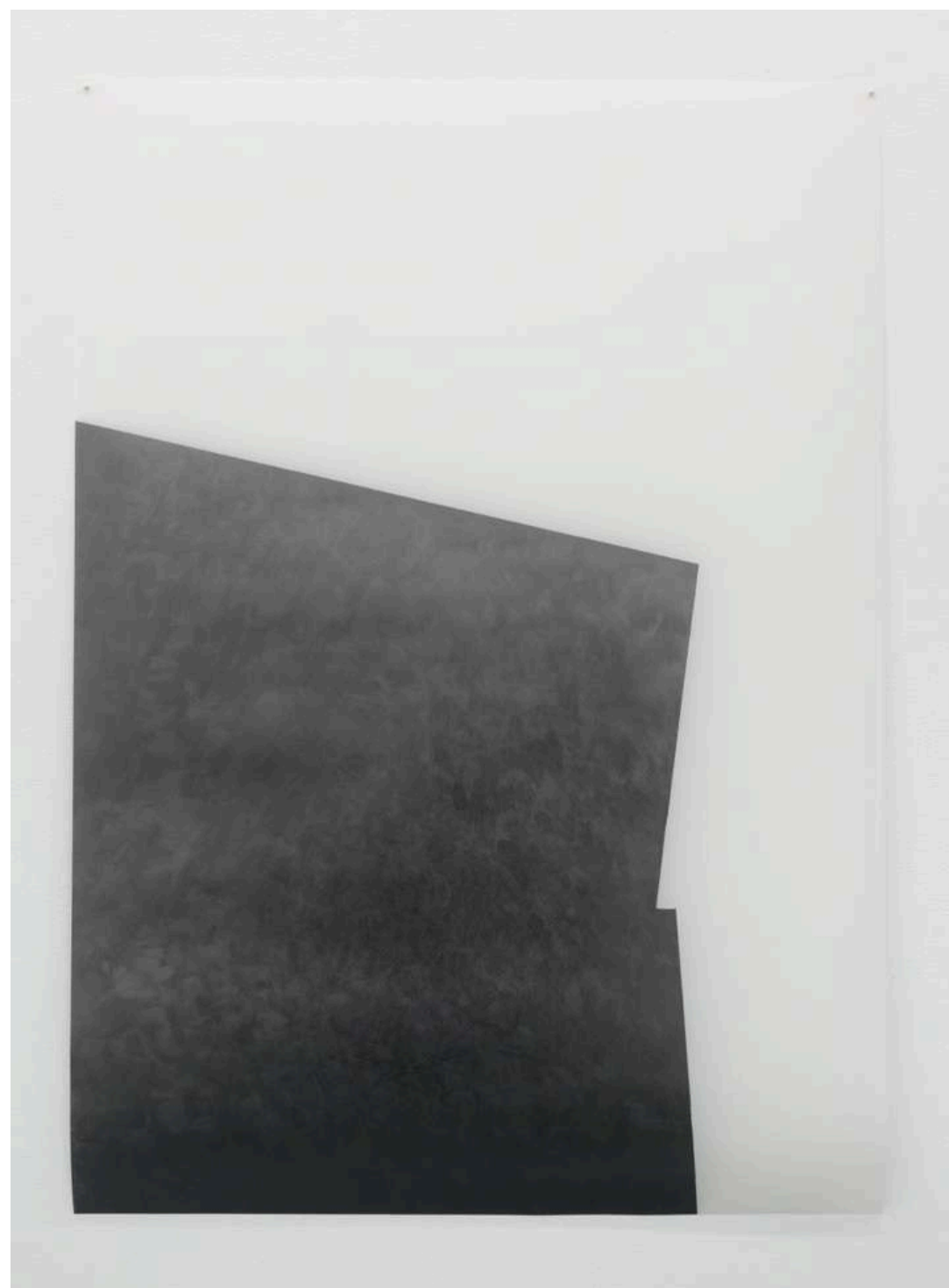
FIVE WALLS SERIES #2 2024 graphite pencil on drafting film 84.1 x 59.4 cm $400