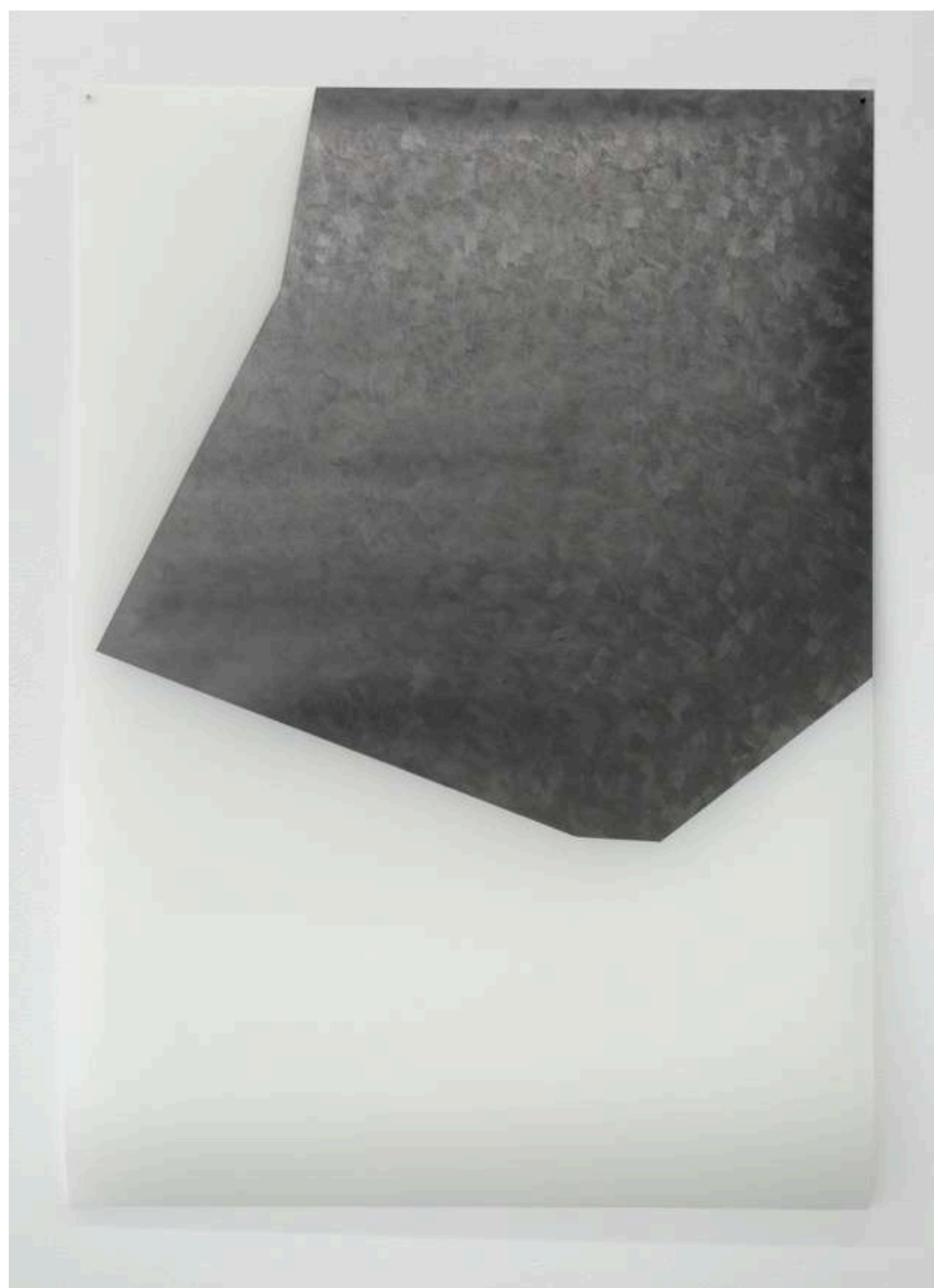
FIVE WALLS SERIES #3 2024 graphite pencil on drafting film 84.1 x 59.4 cm $400