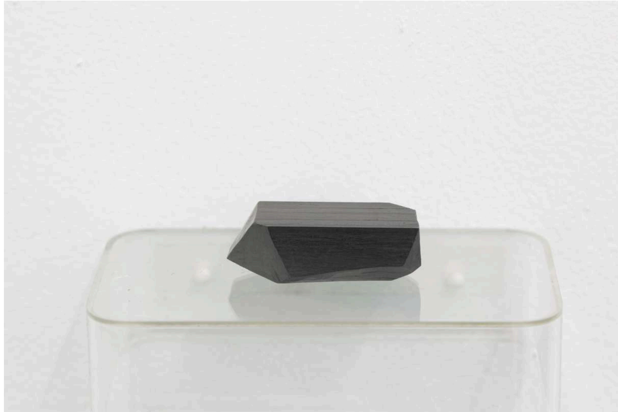
FW FORM #1 2024 carved graphite block on found acrylic box object only 1.5 x 4 x 1.5 cm NFS