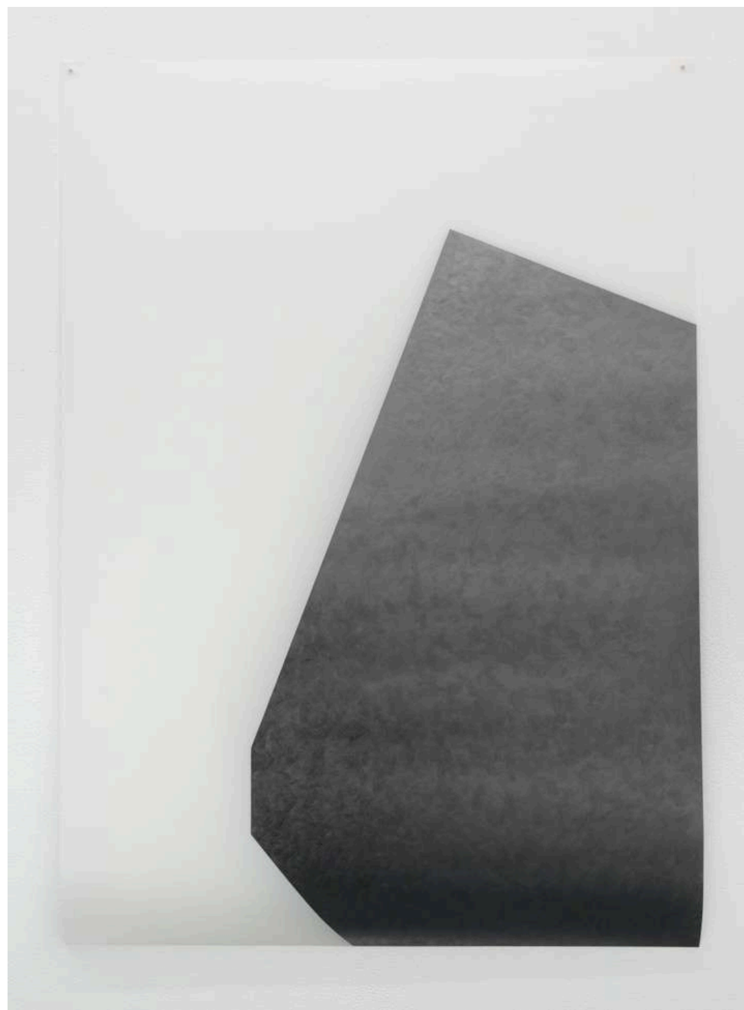
FIVE WALLS SERIES #4 2024 graphite pencil on drafting film 84.1 x 59.4 cm $400