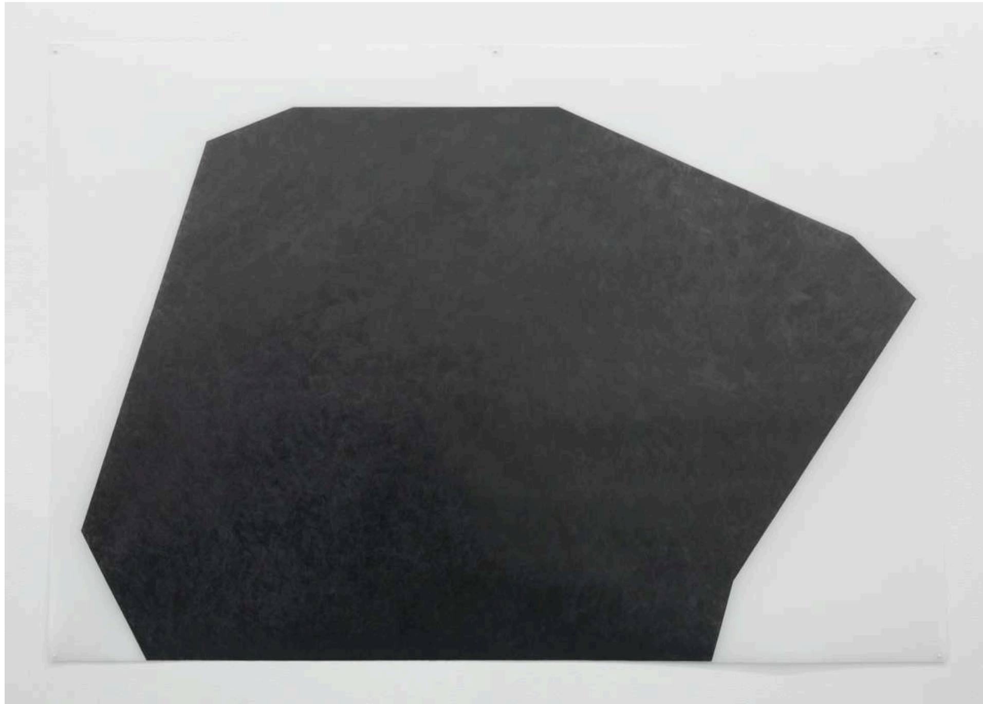
FIVE WALLS SERIES #1 2024 graphite pencil on drafting film 84.1 x 59.4 cm $700