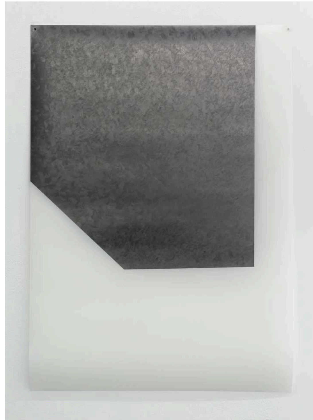
FIVE WALLS SERIES #5 2024 graphite pencil on drafting film 84.1 x 59.4 cm $400