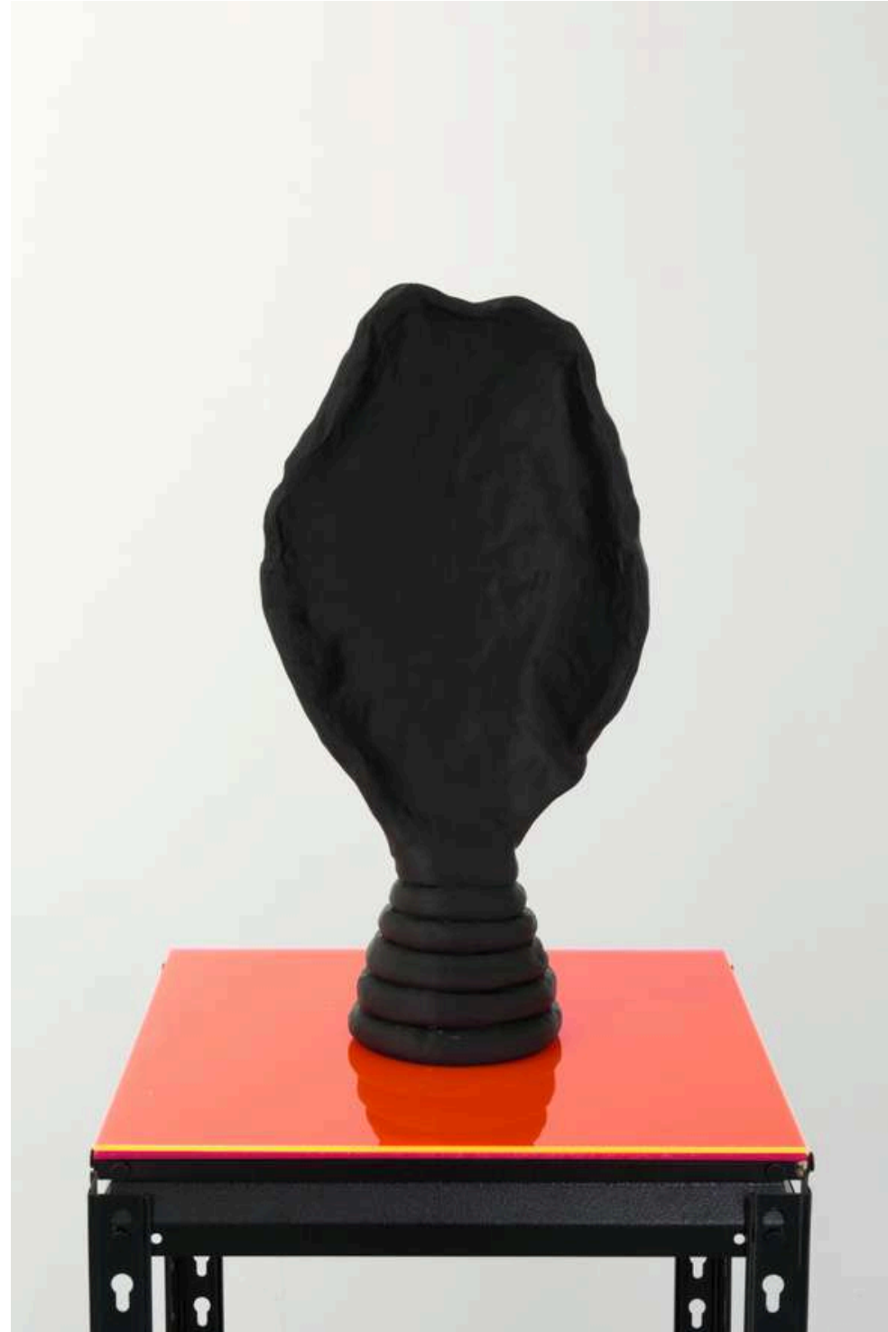
Archetype Replica 2024 3D print 467 x 232 x 129mm $850