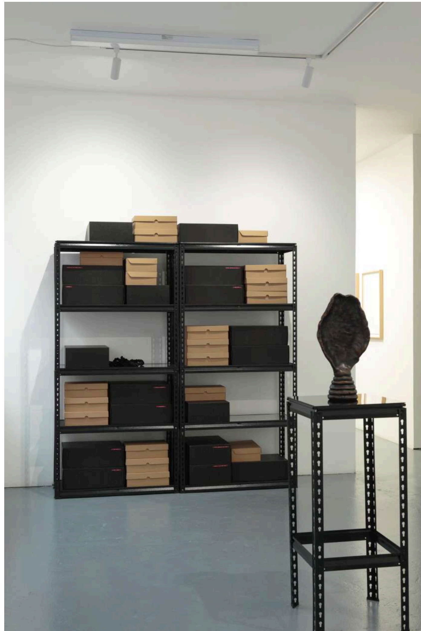
Archive 2024 mixed medium installation 1800 x 1800 x 400mm NFS