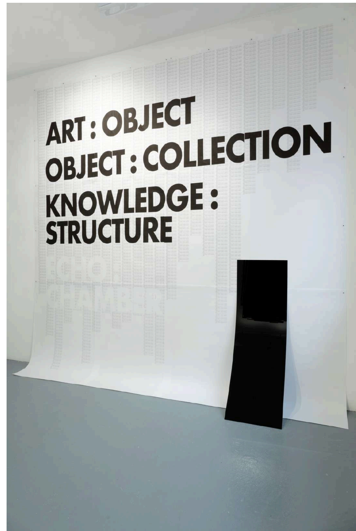
Echo : Chamber (Metadata Wall) 2024 digital print and perspex 3000 x 3000mm NFS - smaller prints available