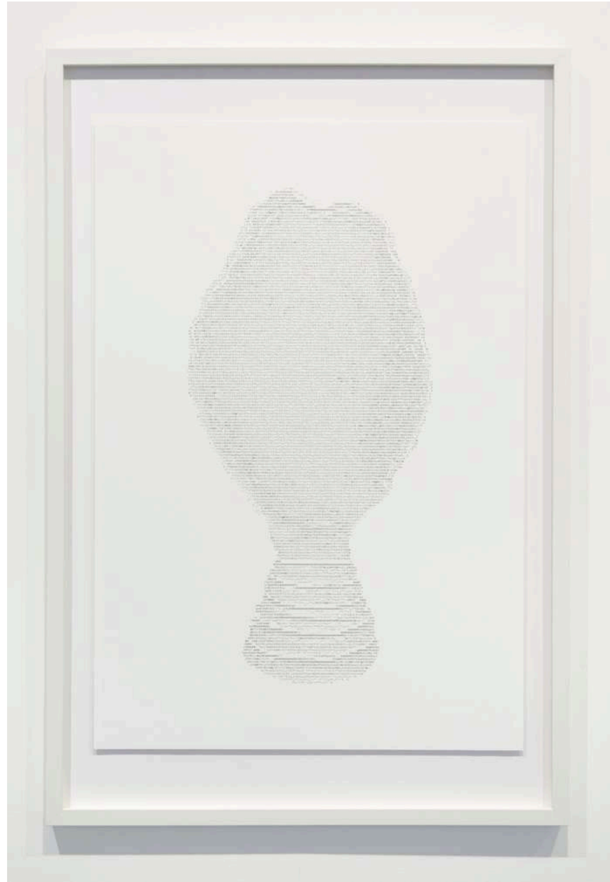
Archetype as Code - Front 2024 archival print on cotton rag 760 x 520mm $950