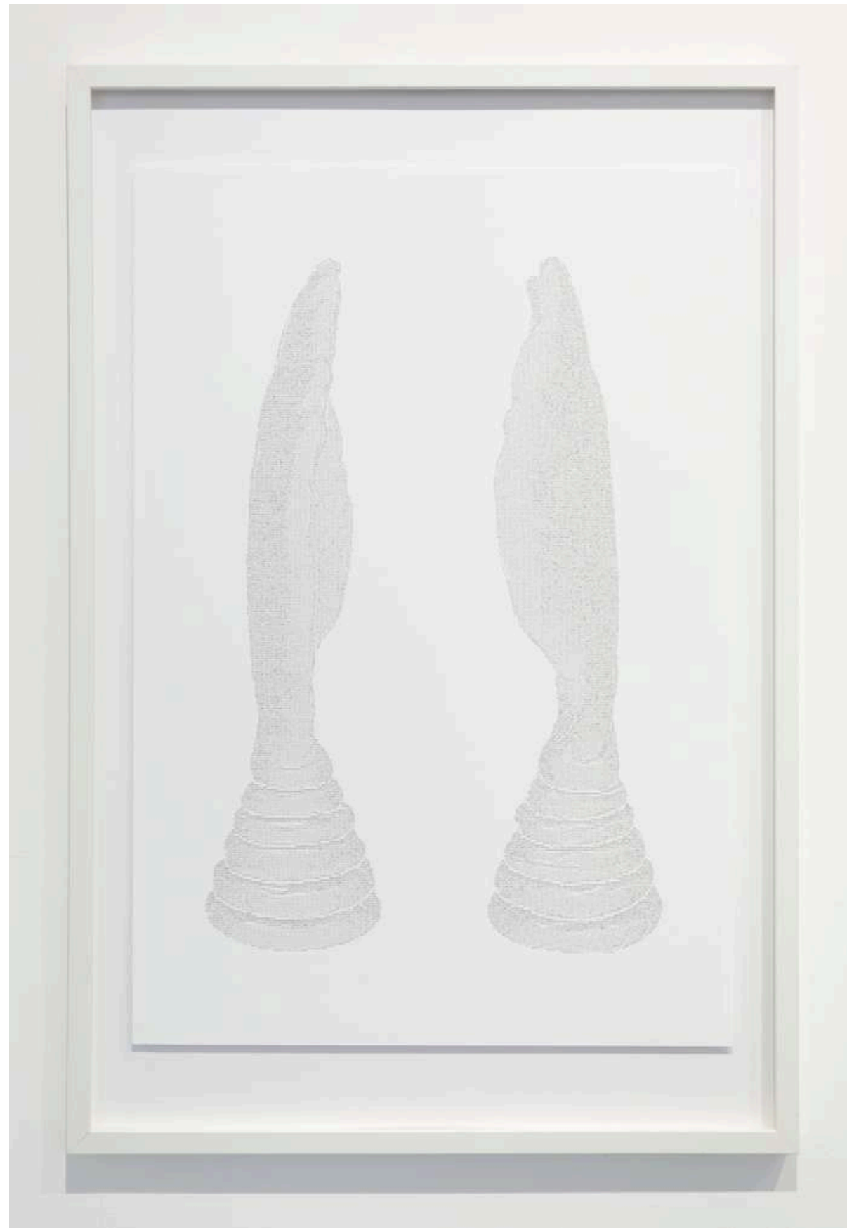
Archetype as Code - Side 2024 archival print on cotton rag 760 x 520mm $950