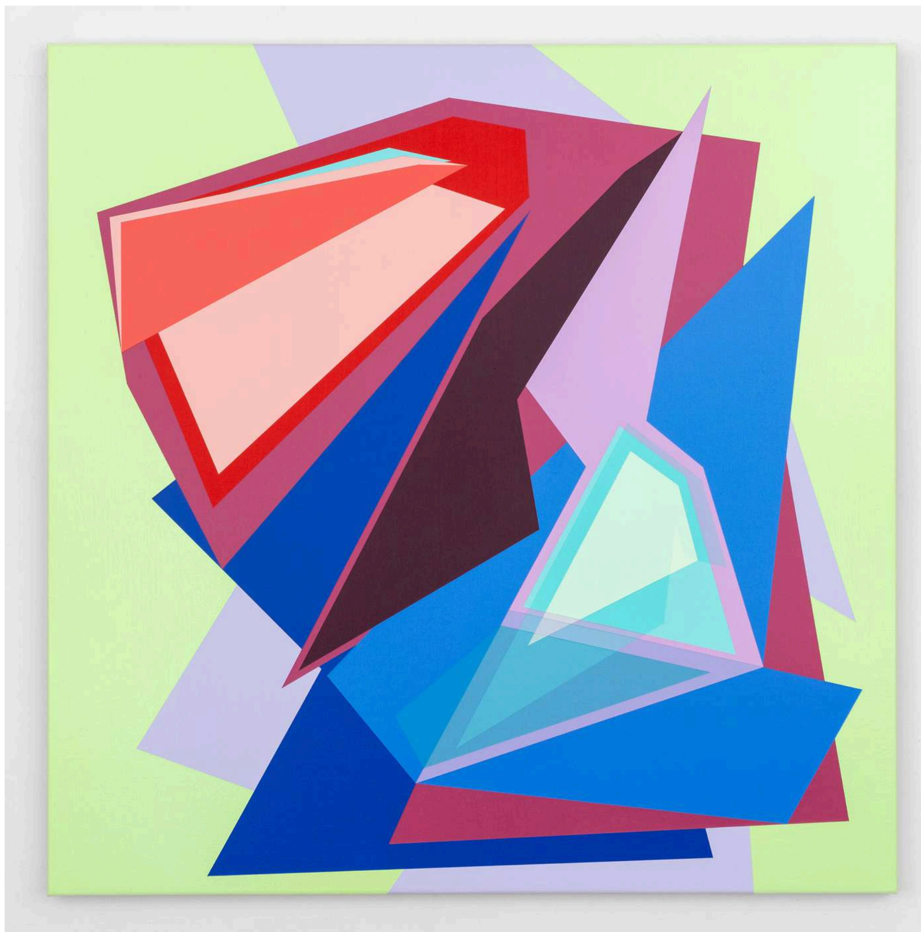
Utrillion Acrylic on linen 102 x 102 cm $3,800