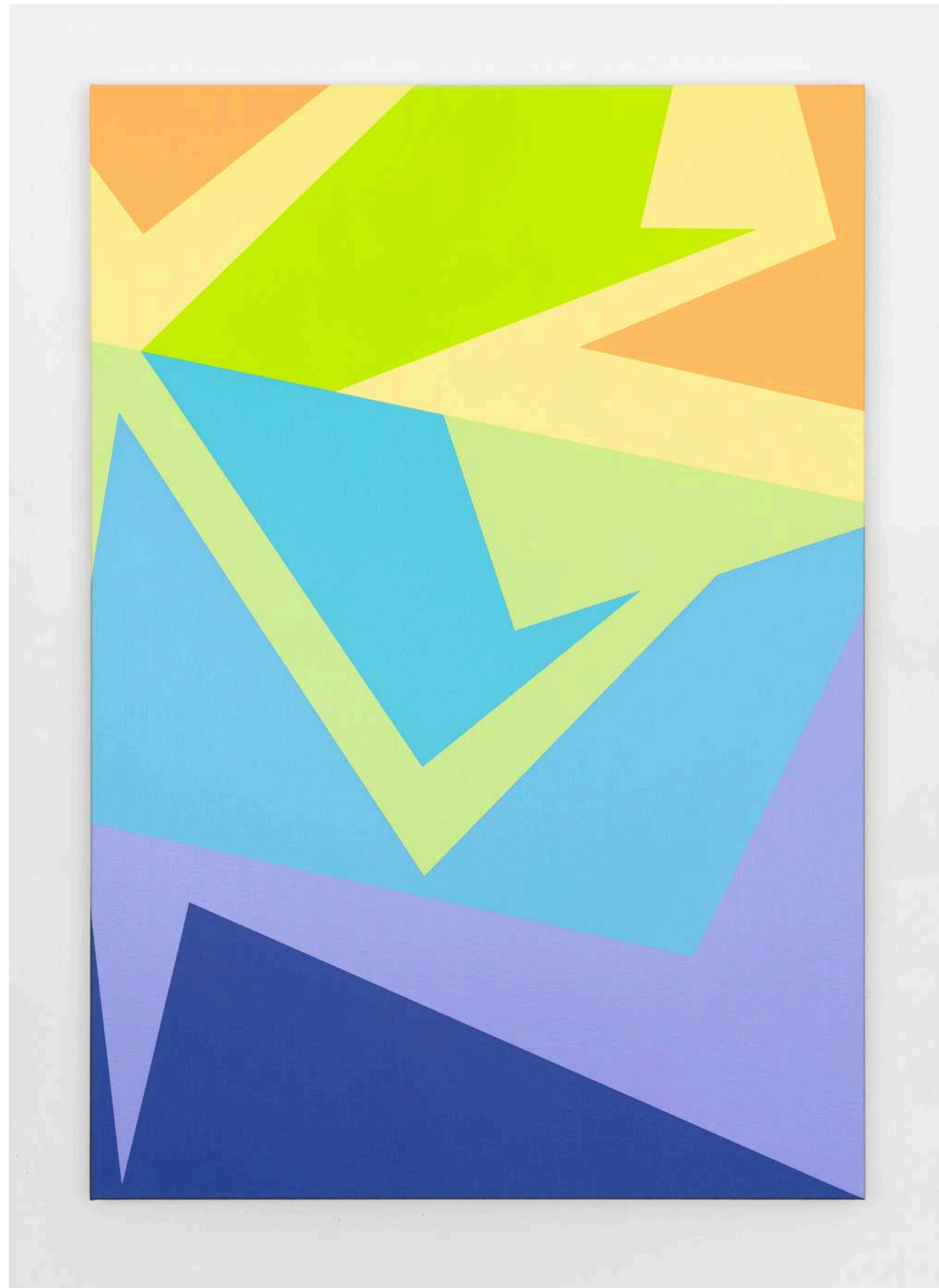
Minkaz Acrylic on linen 117 x 82 cm $3,800