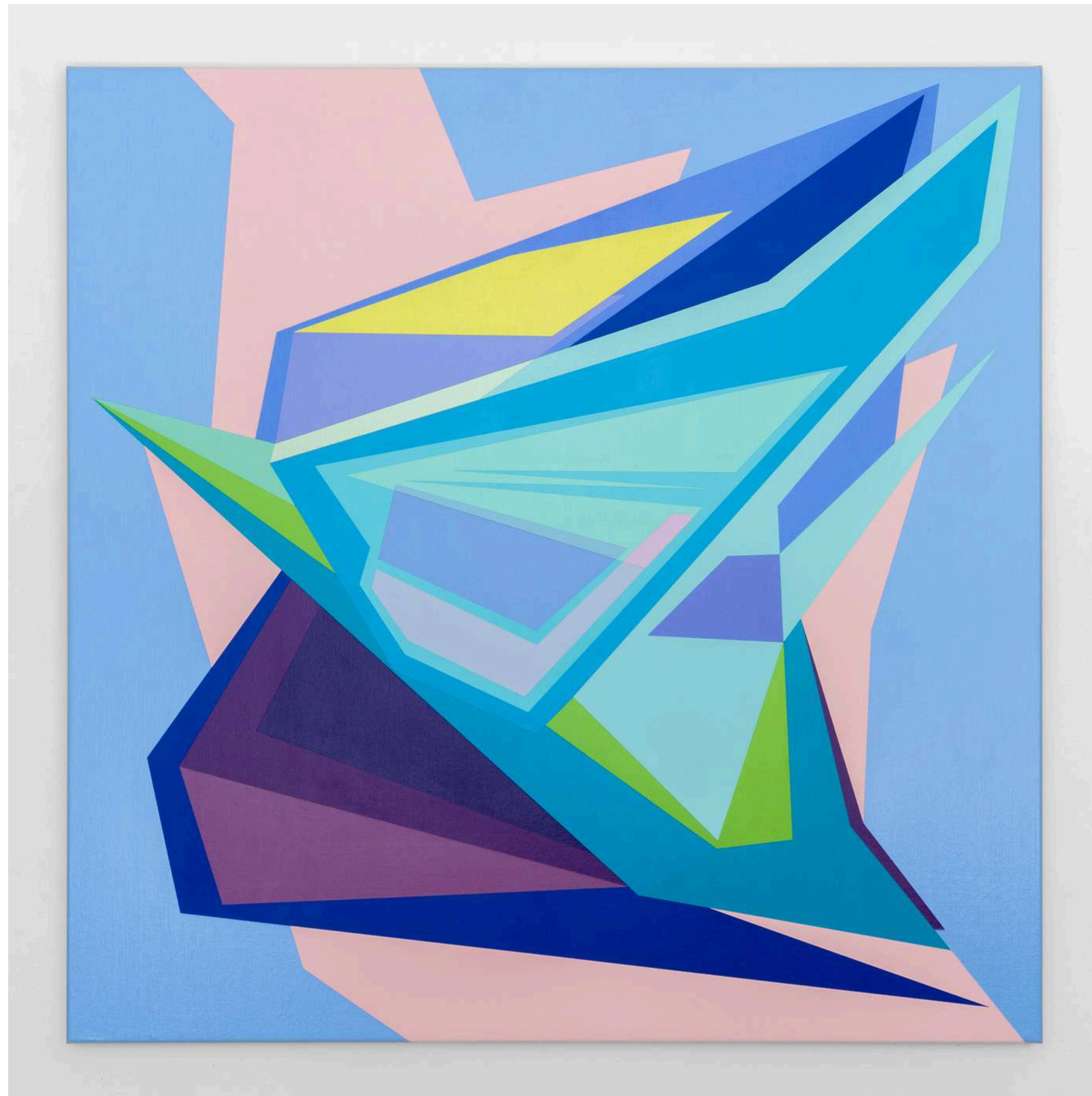
Zimka Acrylic on linen 102 x 102 cm $3,800