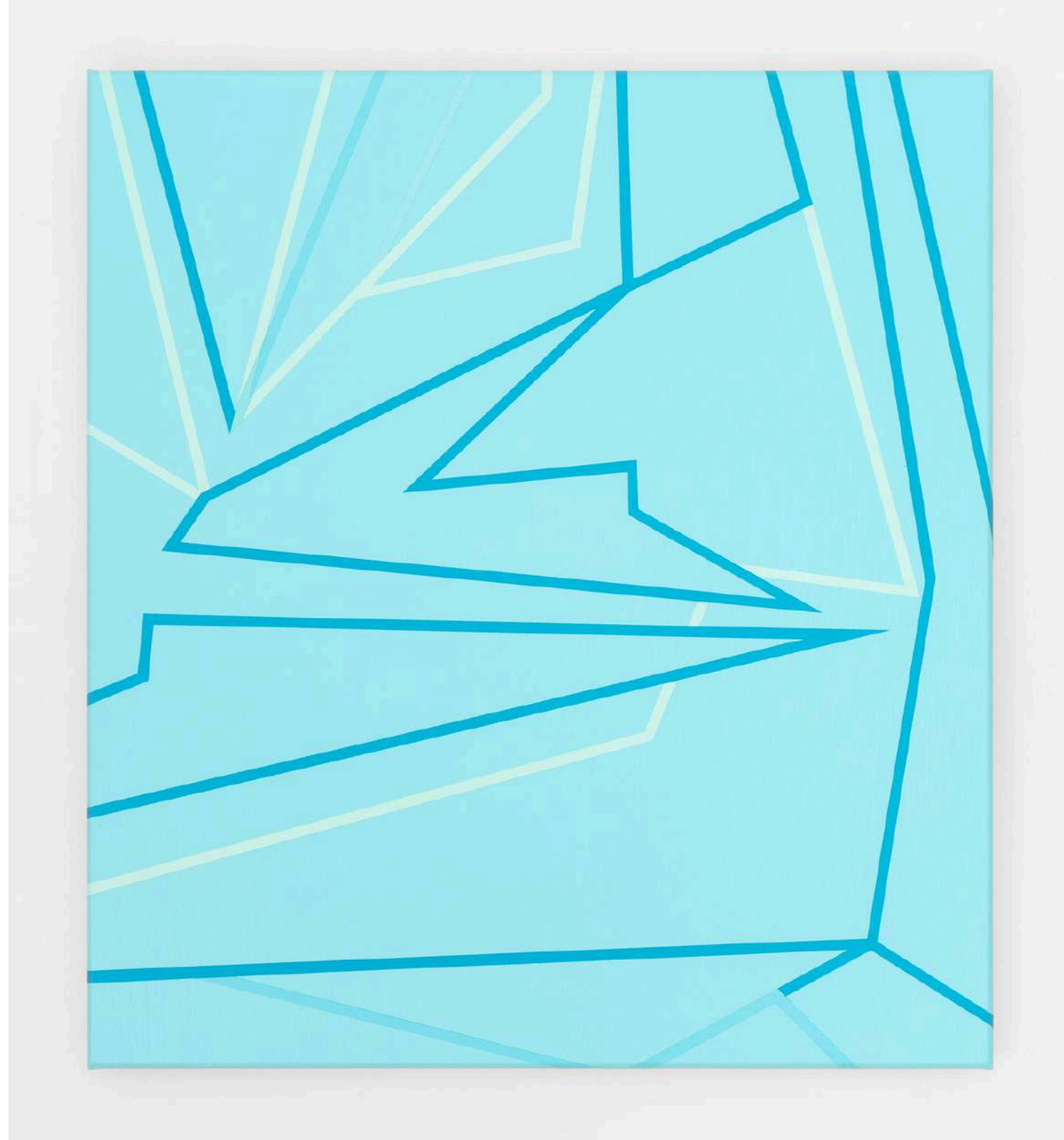
Asilomar Blue Acrylic on linen 56 x 51 cm $2,000