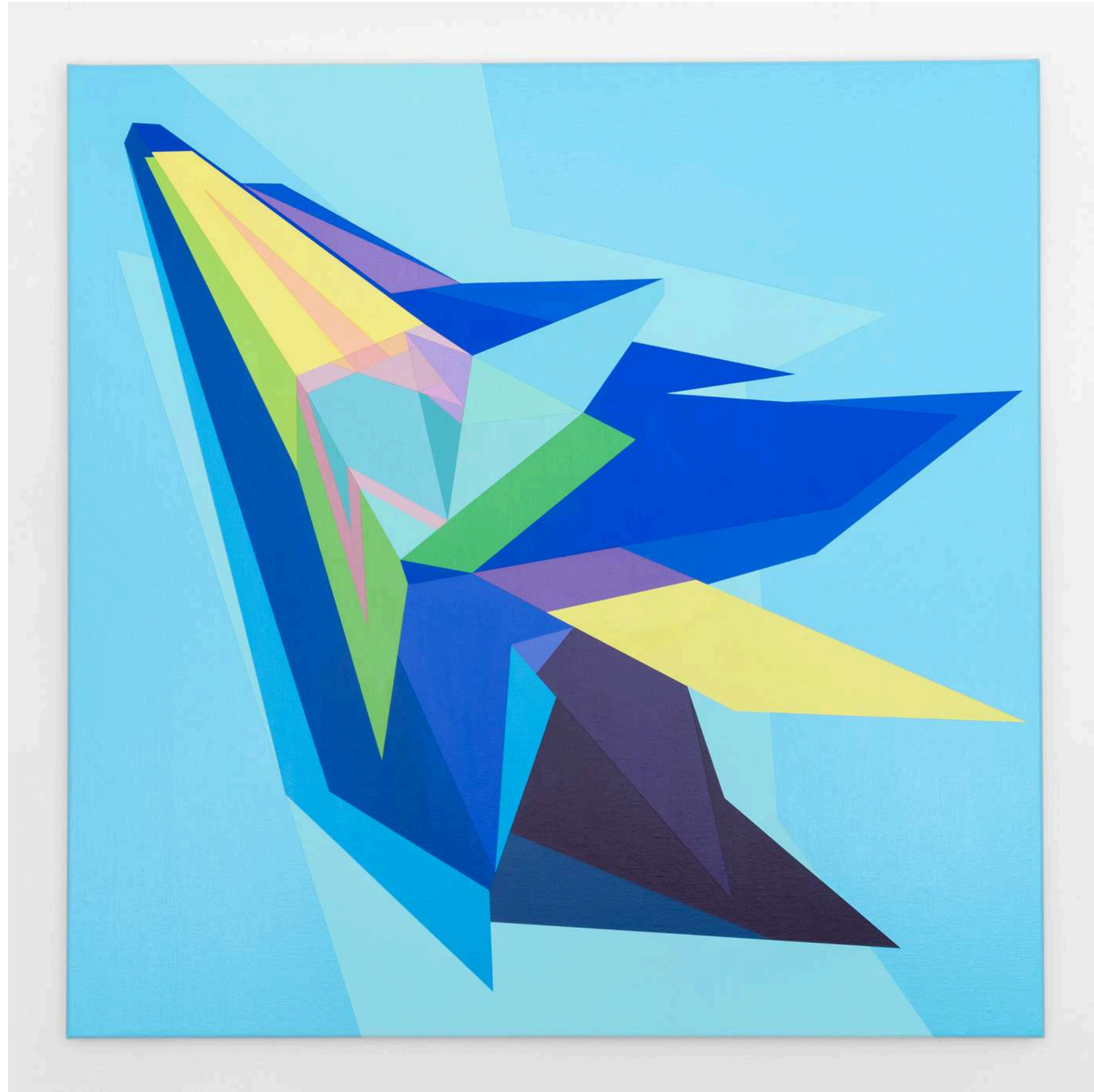
Chantuse Acrylic on linen 102 x 102 cm $3,800