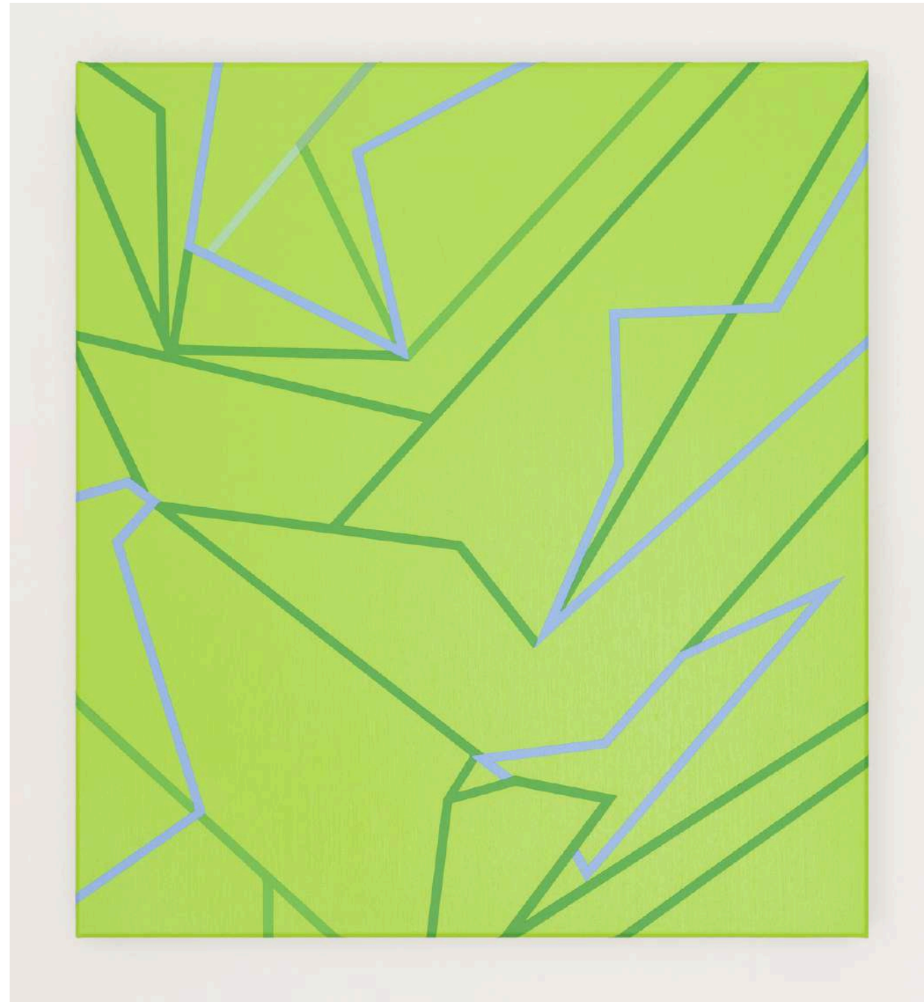
Coronita Sage Acrylic on linen 56 x 51 cm $2,000