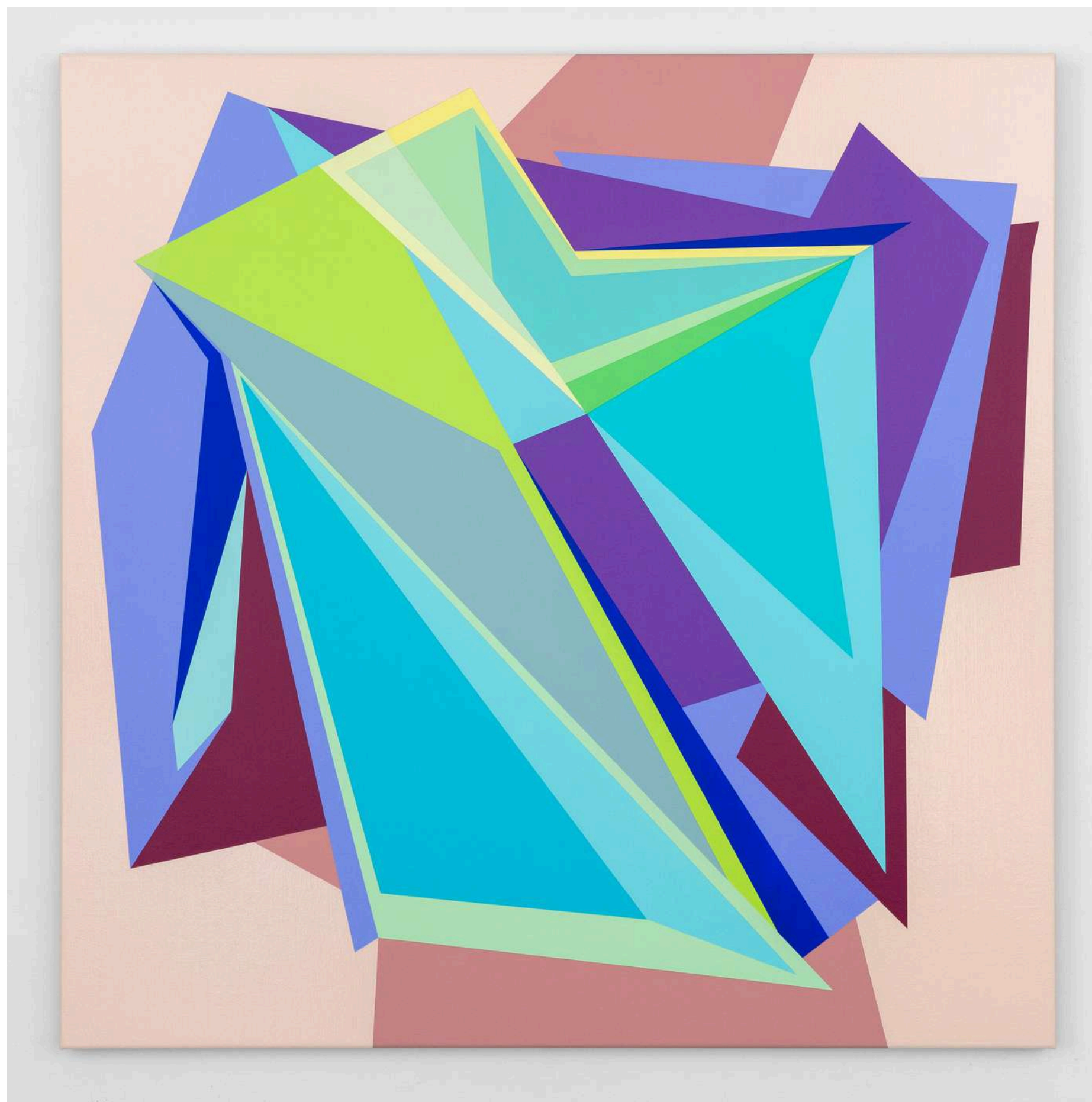
Ulambra Acrylic on linen 102 x 102 cm $3,800