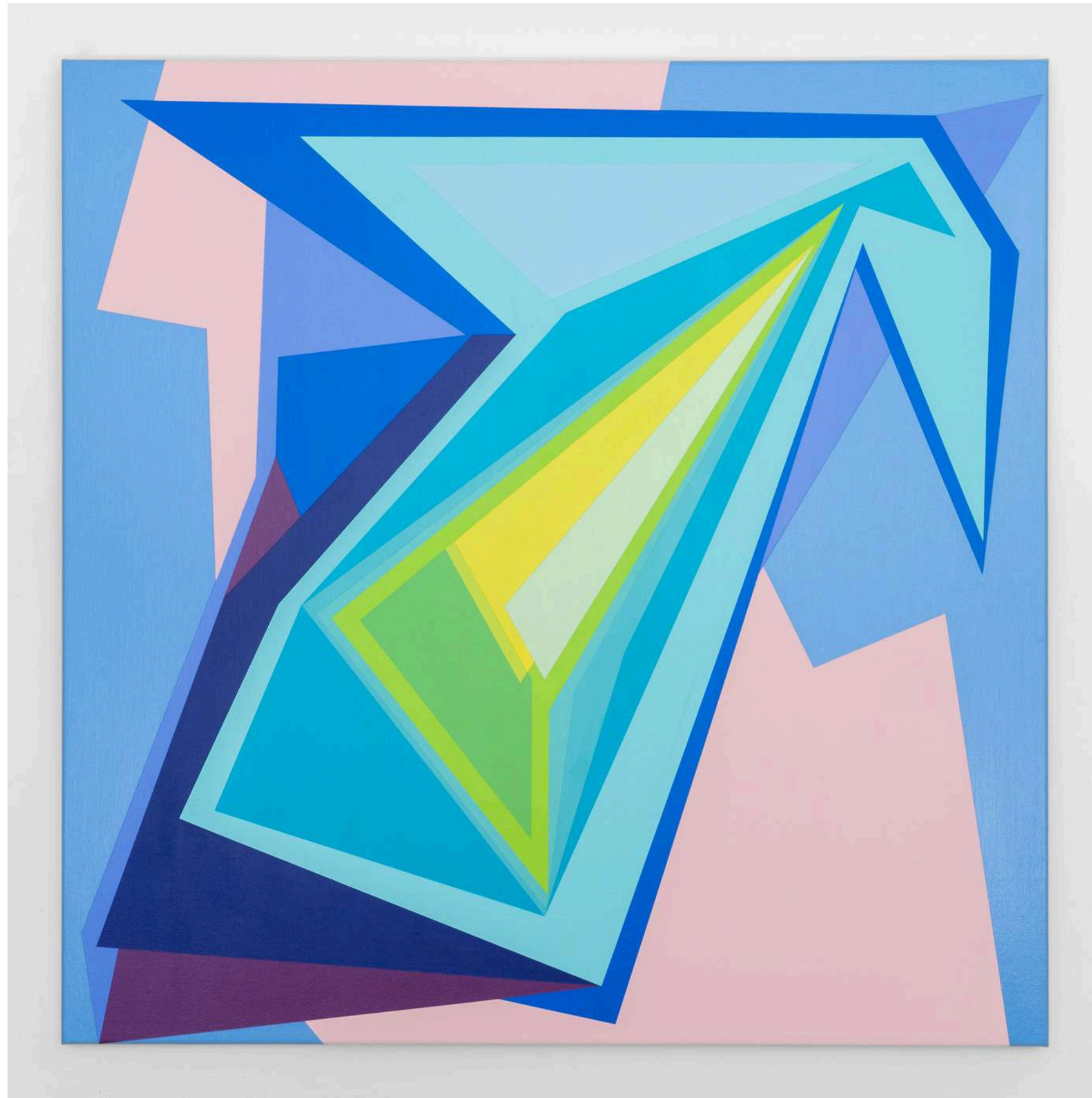
Tanjael Acrylic on linen 102 x 102 cm $3,800