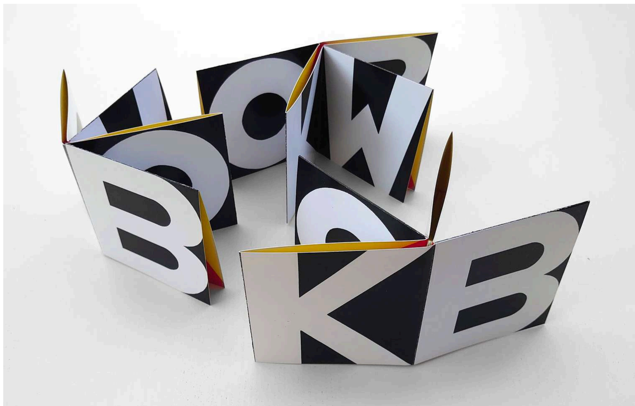
Bookwork (Folds) (Multiple edition) 2024, printed bookwork, 4 pages 10 x 10 cm (page), 10 x 10 x 10 cm (open) Edition of 125 FREE