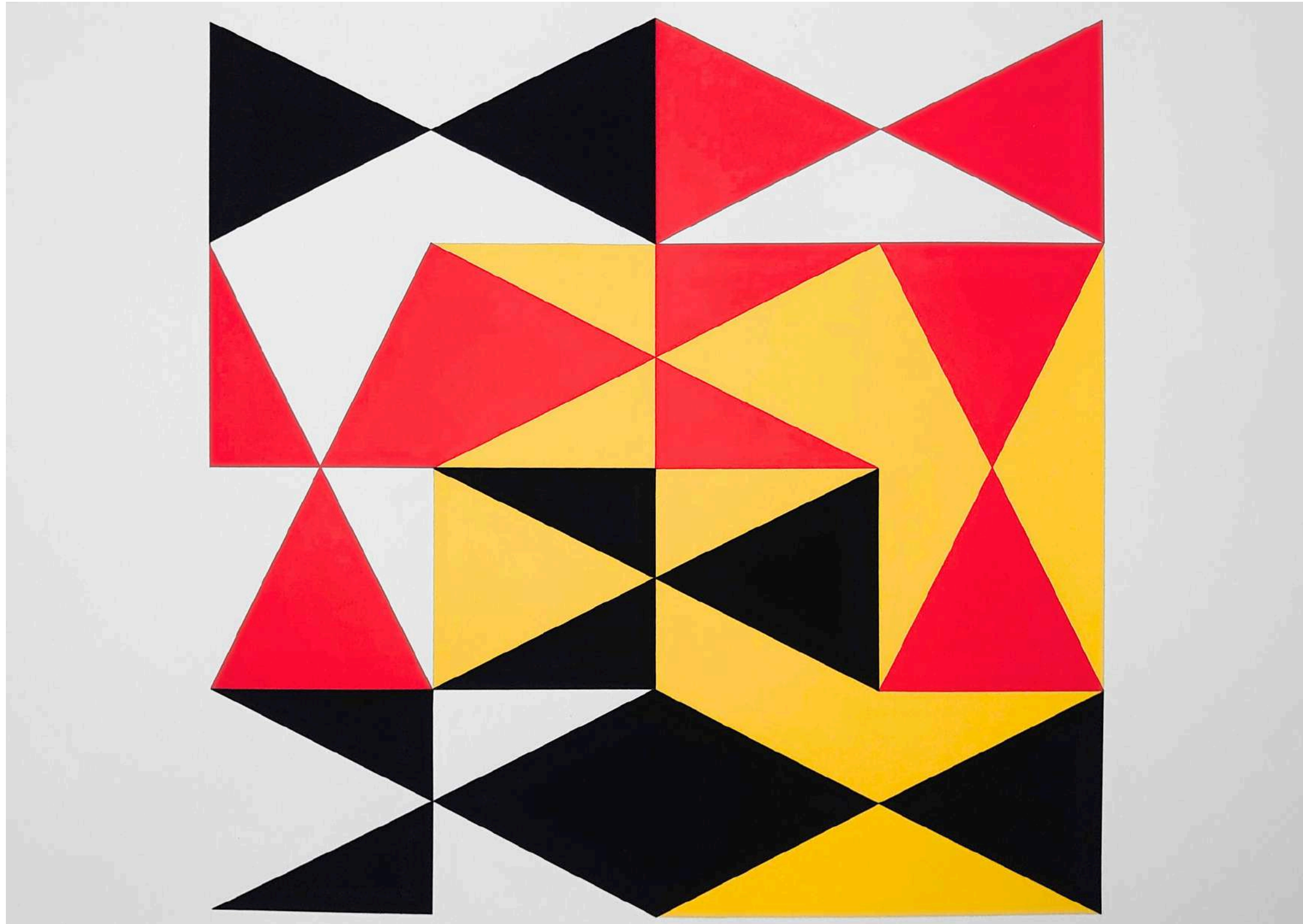
Folds #1-8 (Composite) no.2 (for Five Walls) 2024 gouache on paper 42 x 59.4 cm (work)$795 (unframed)