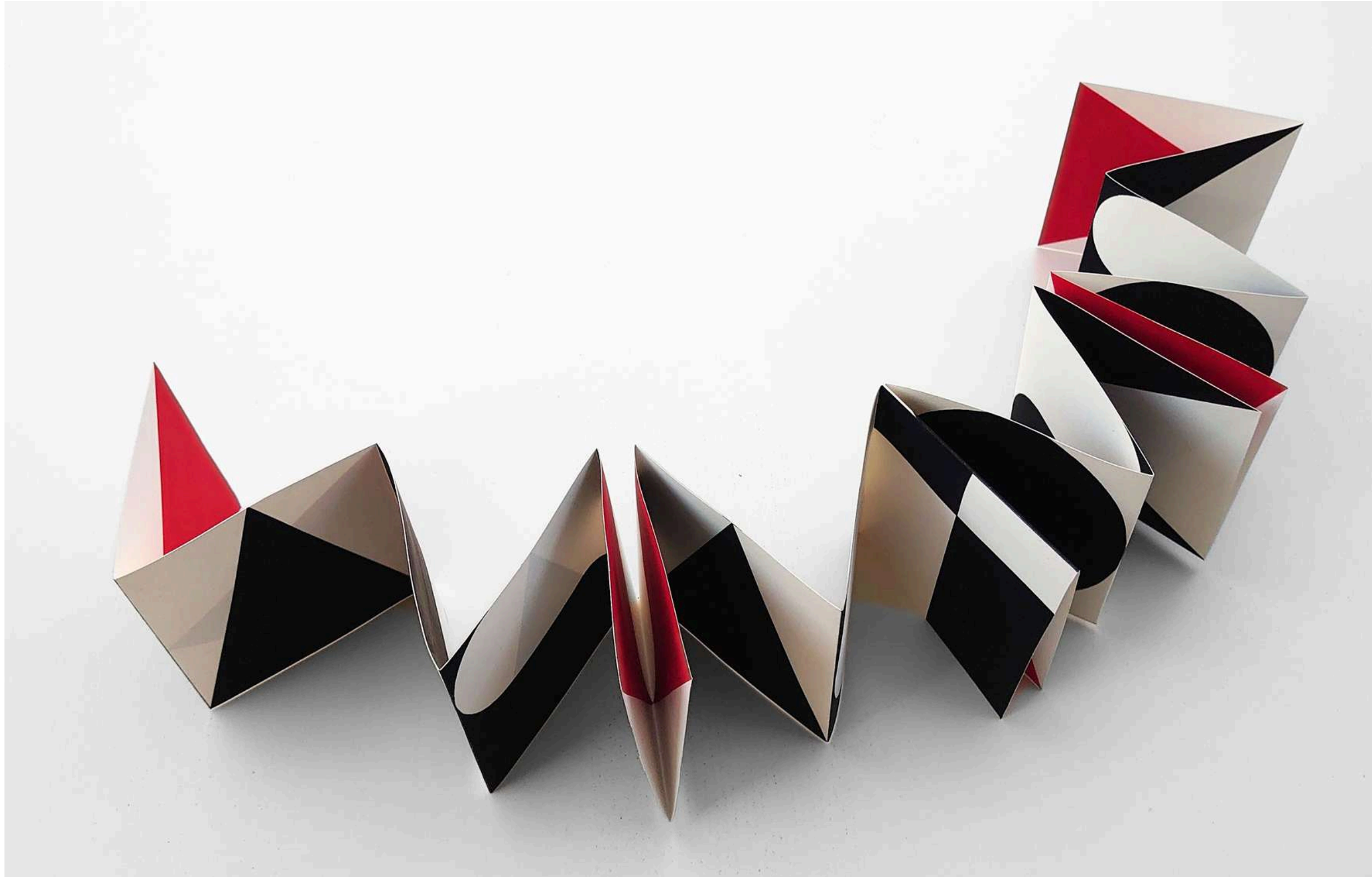
Abstract Bookwork 2021 hand-painted bookwork 16 pages gouache on paper 10 x 10 cm (page) dimensions variable (open) Edition of 2 + 1 AP $795