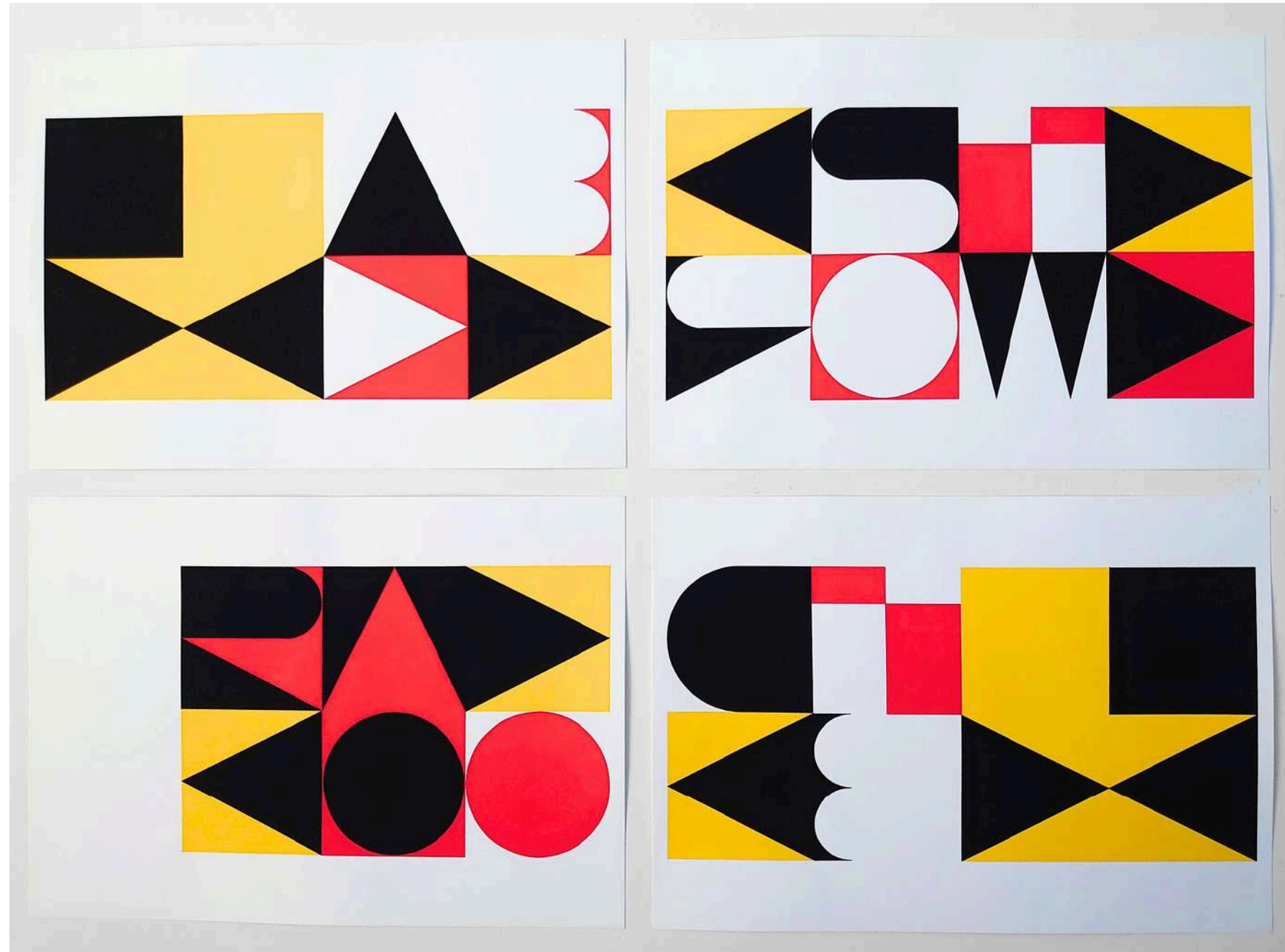
Study for Abstract Bookwork 2022-23 gouache on paper 4 works 29.7 x 42 cm (each work) Edition 3 + 1 AP $995 (set of 4) (unframed)