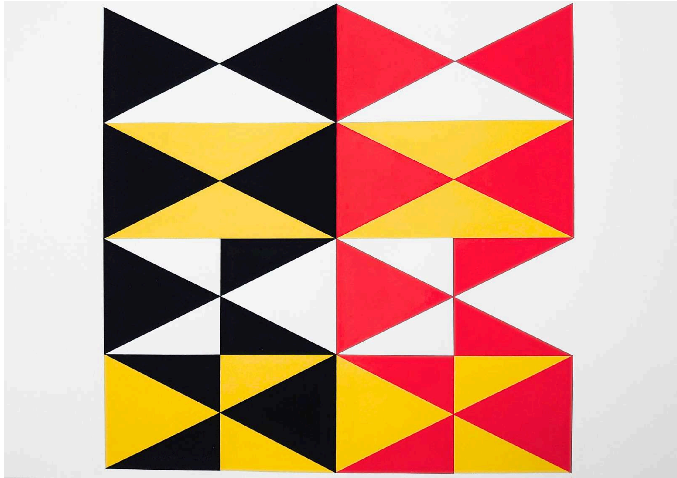
Folds #1-8 (Composite) no.1 (for Five Walls)