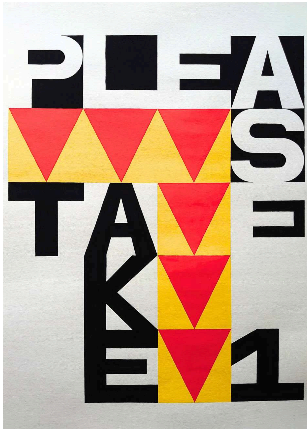
Please Take 1 2022 gouache on paper 59.4 x 42 cm (work) NFS