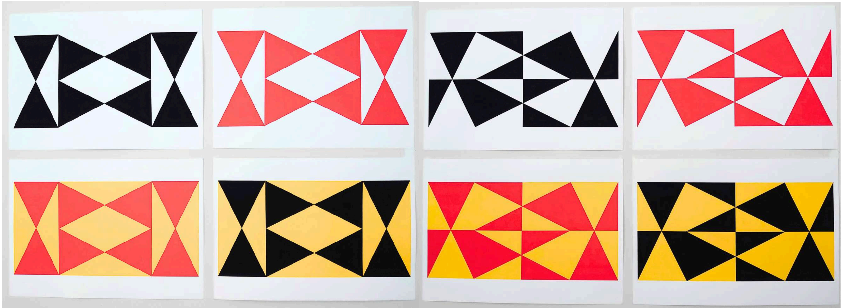
Folds #1-8 2024 gouache on paper 29.7 x 42 cm (each work) $350 each (unframed)