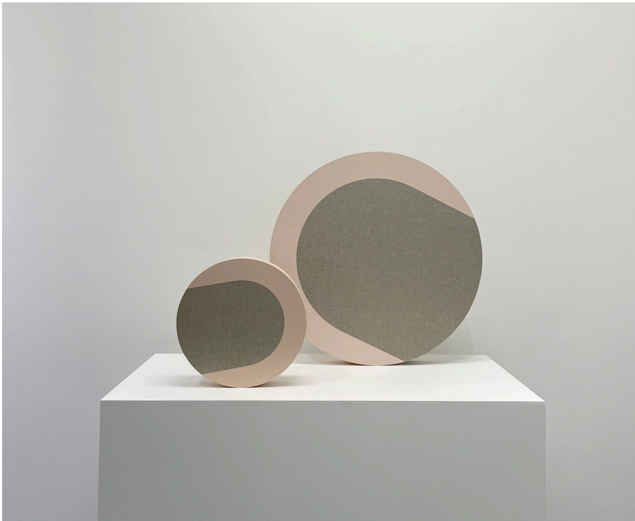
Daydream(3) 2025 acrylic on linen H30 x D7cm $2,900