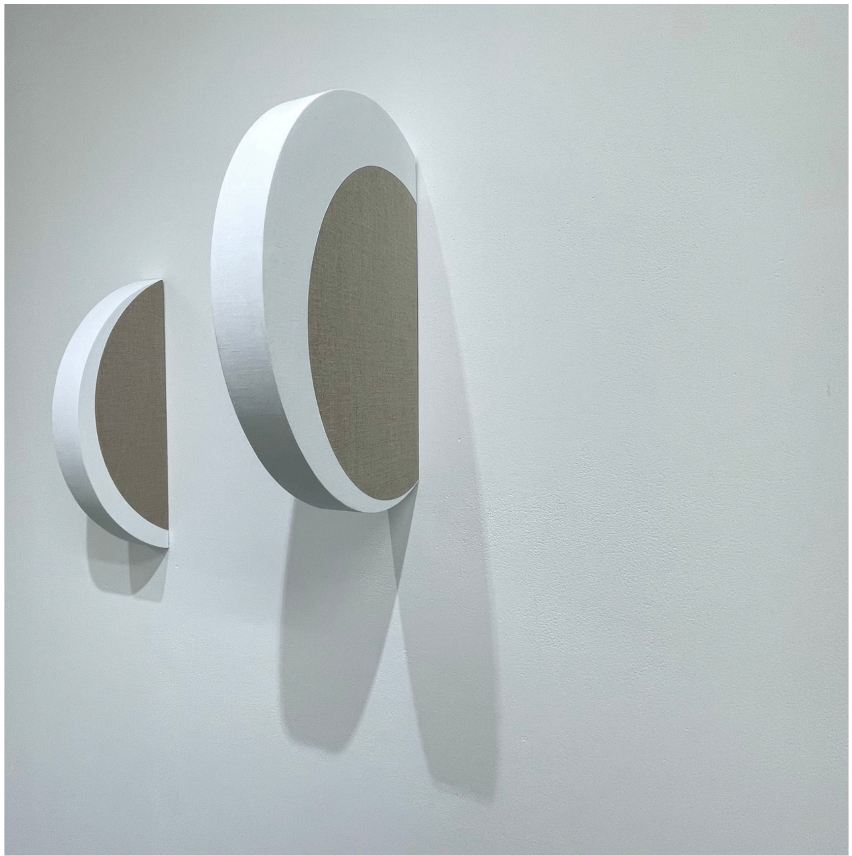
Told In A Half Moon 2025 acrylic on linen H38 x W5 x D14cm $1,200