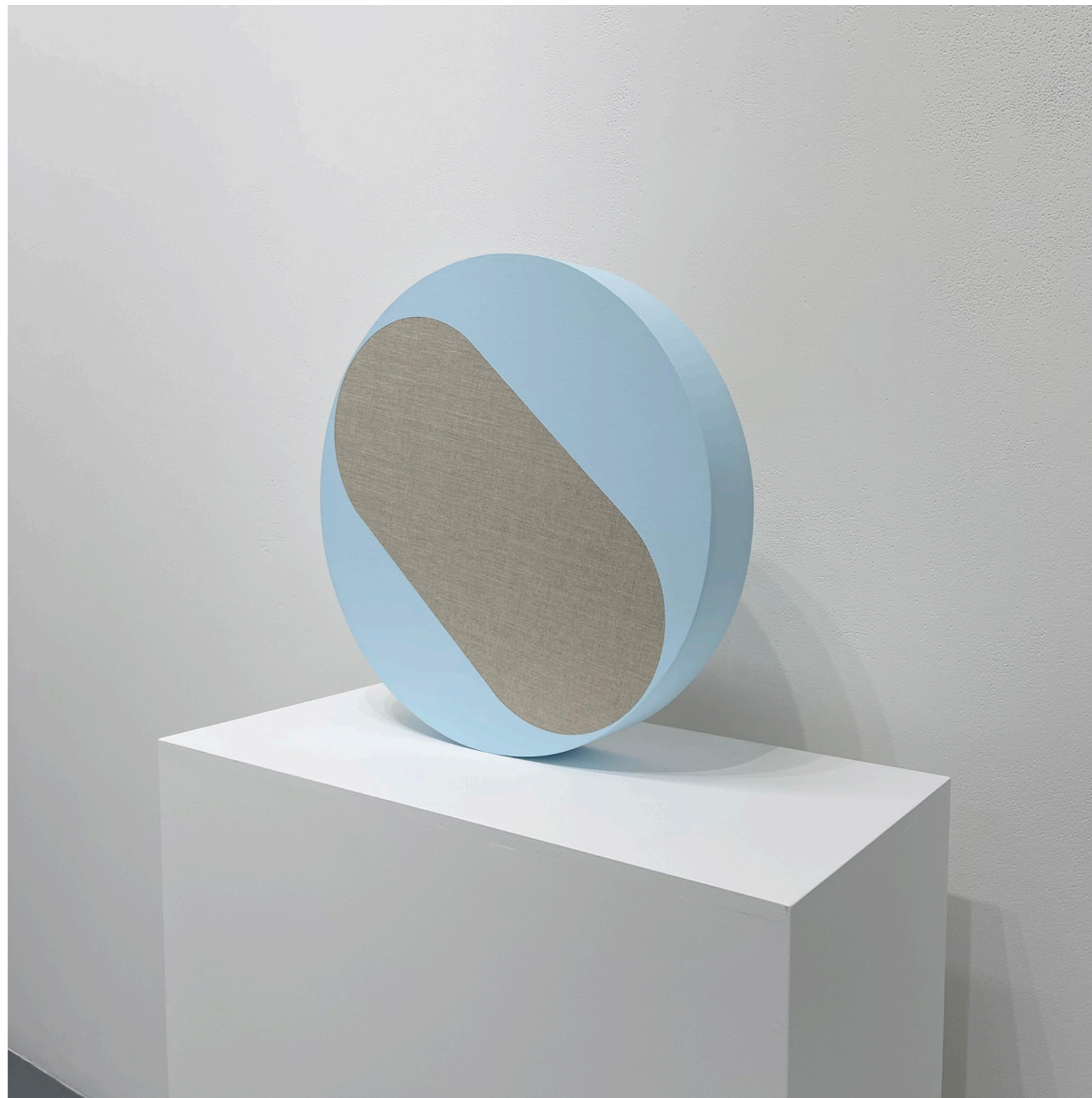
Day After Day 2025 acrylic on linen H40 x D7cm $3,200