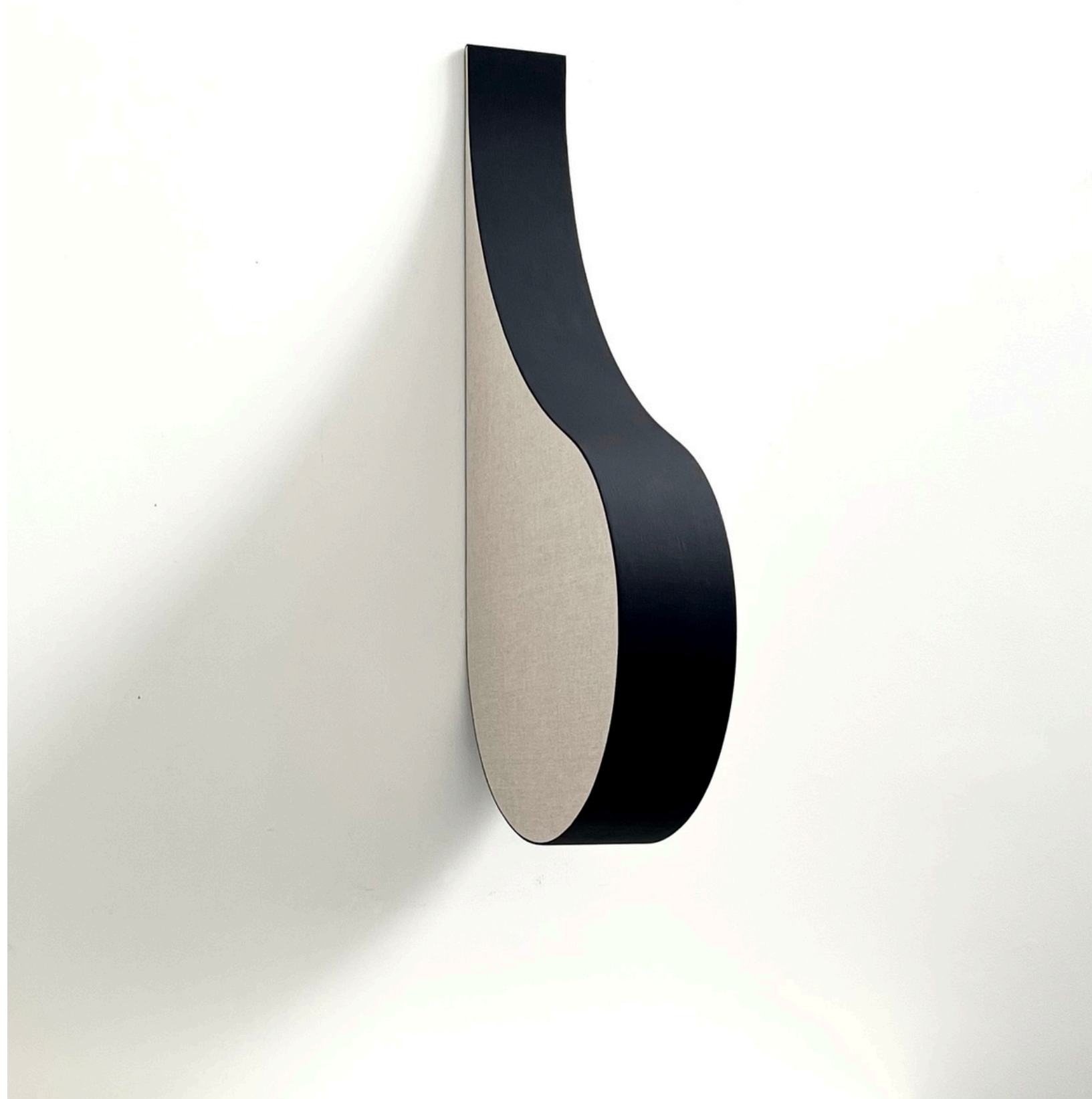
Whisper 2025 acrylic on linen H89 x W12 x D41cm $5,200