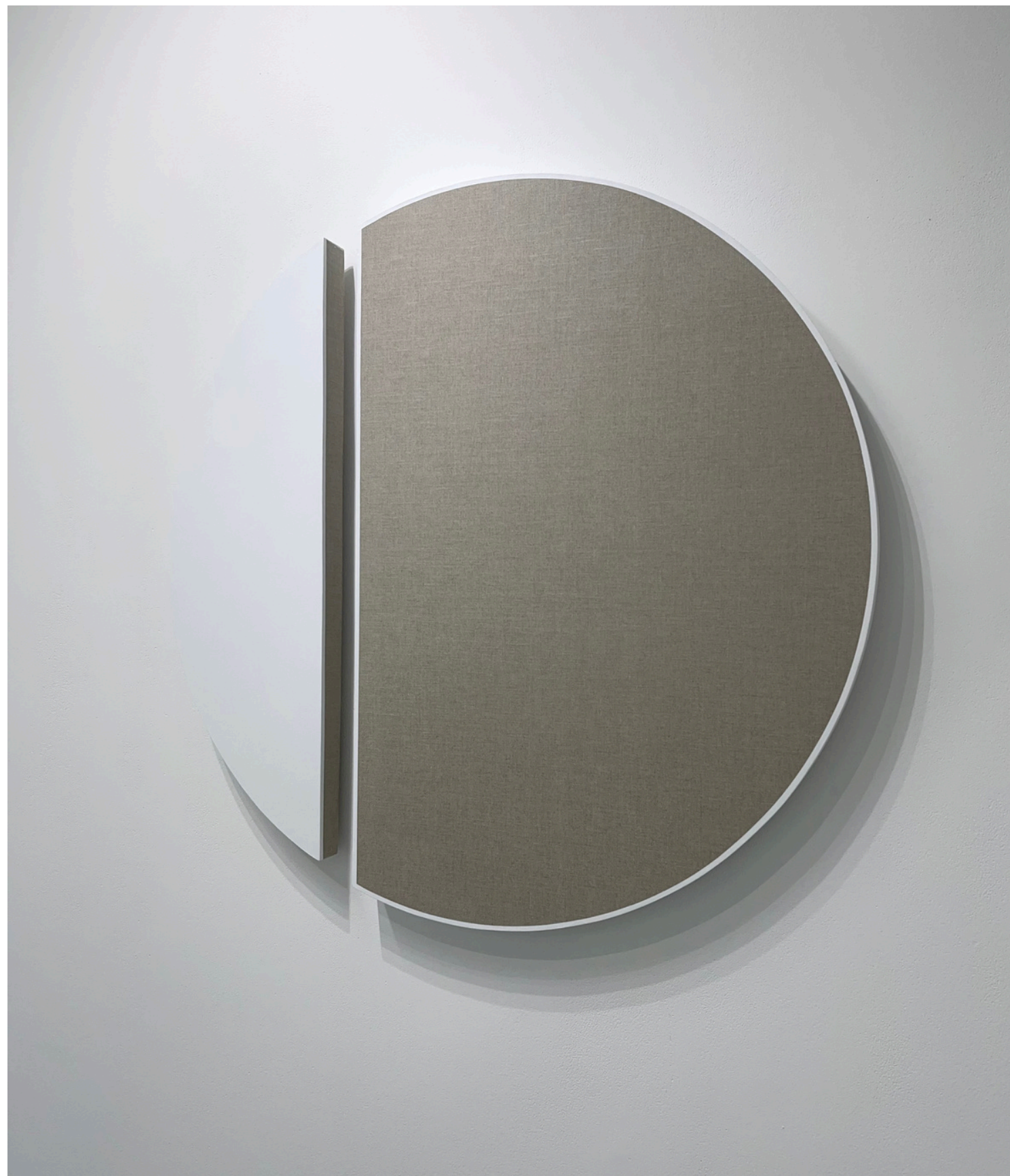
Light To Lighten 2025 acrylic on linen H90 x W94 x D6.5cm $5,900