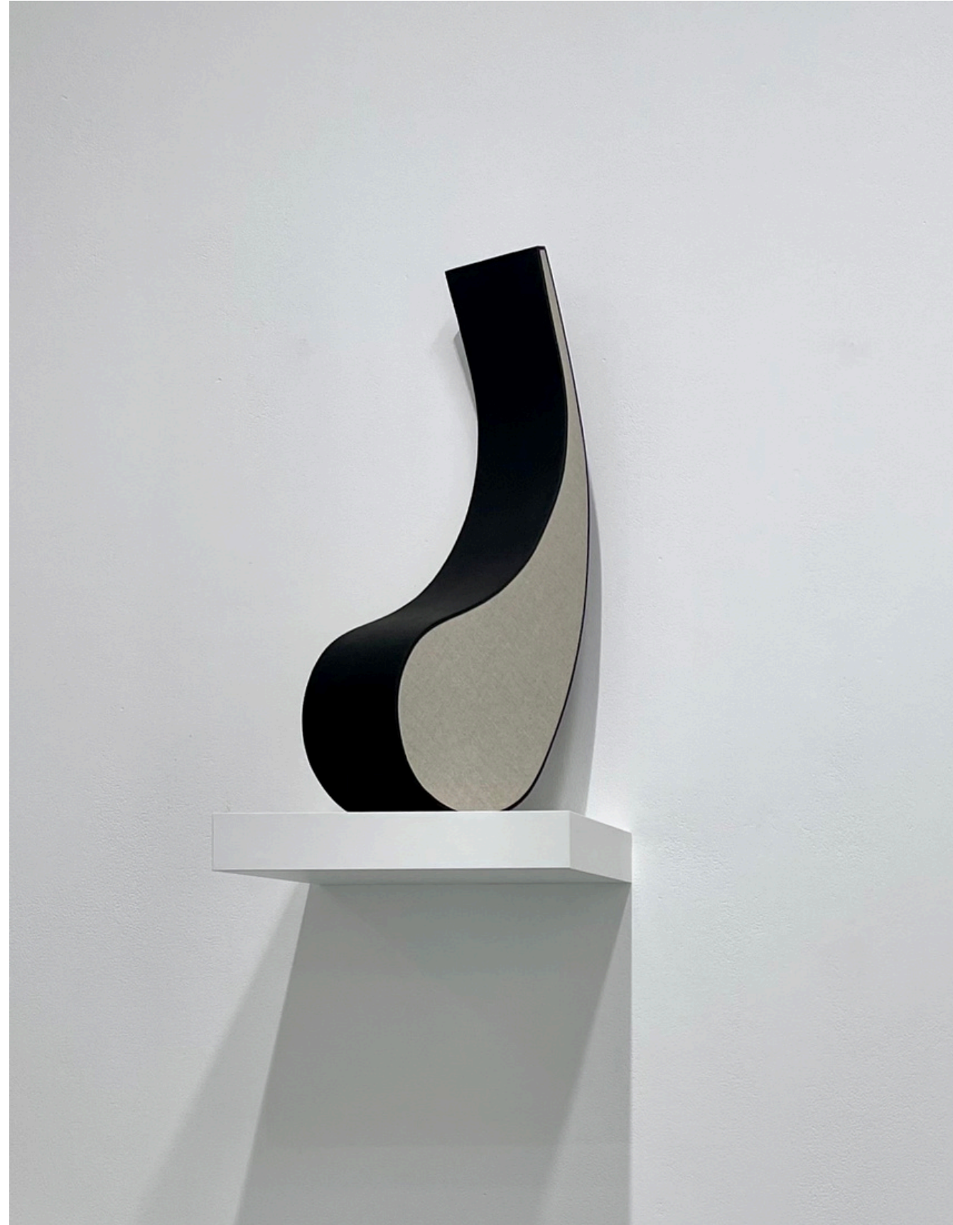
The Little Things You Say 2025 acrylic on linen H56 x W30 x D26cm $2,200