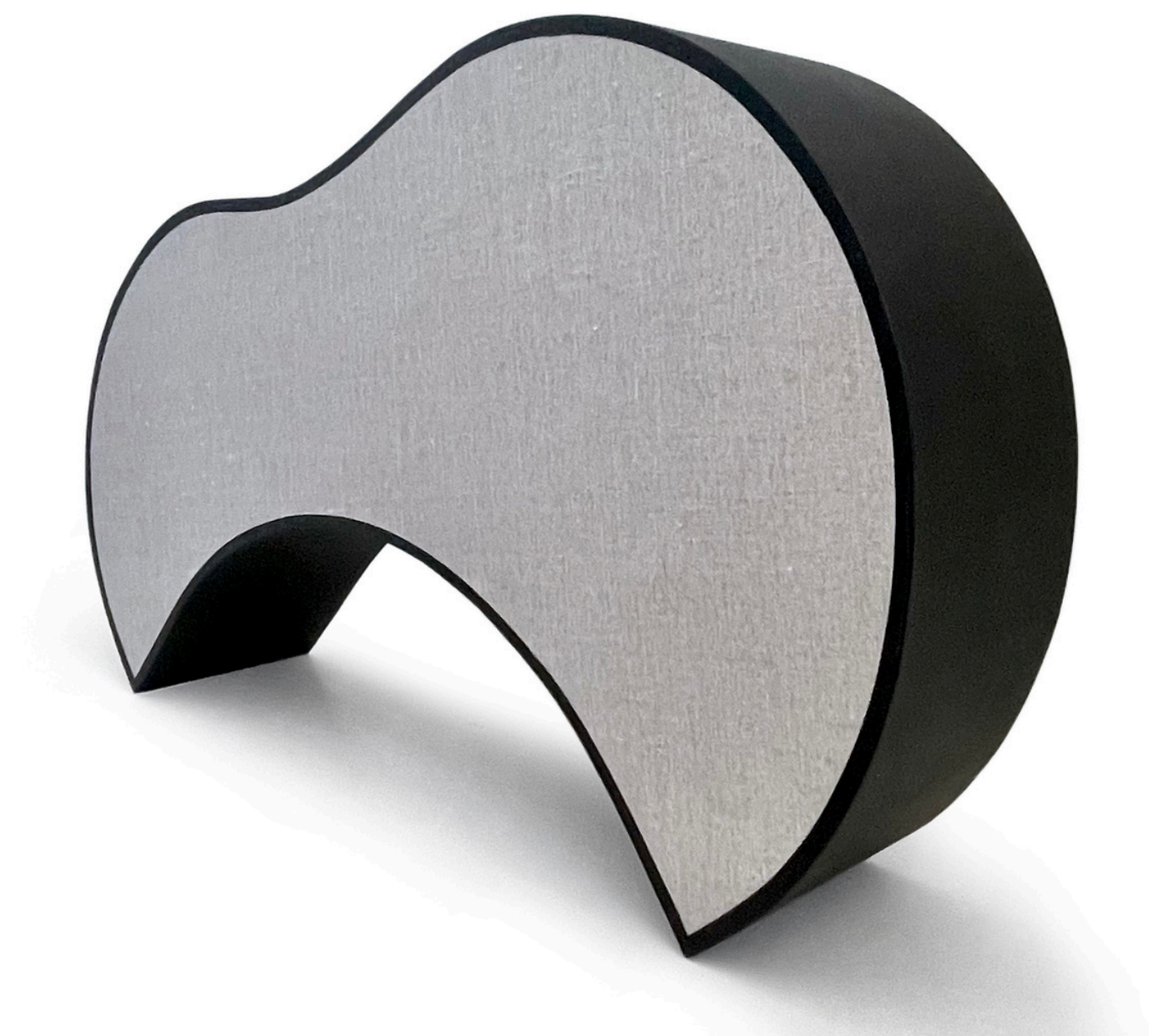
Loop-de-loop 2025 acrylic on linen H29 x W50 x D10cm $3,800