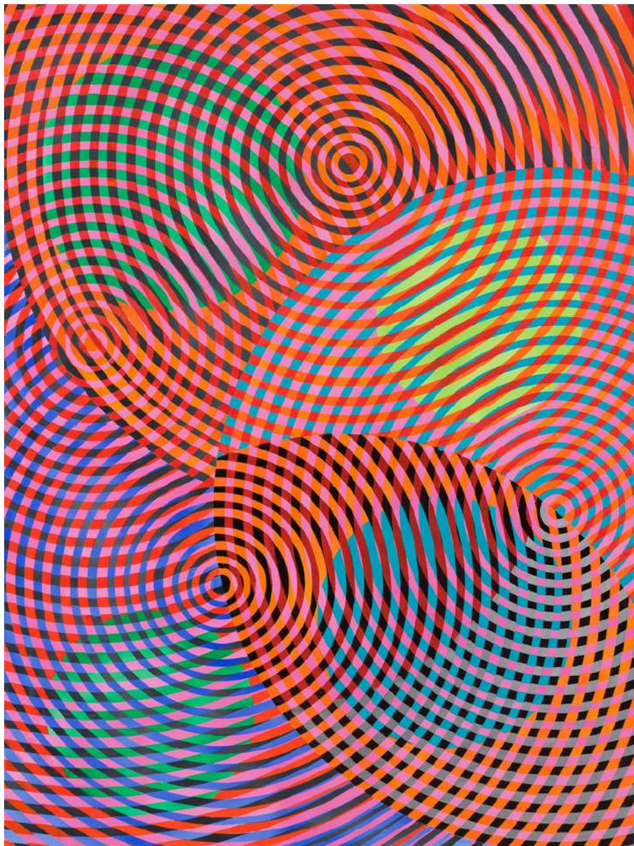
sonic network no. 103 2025 oil and acrylic on canvas 92 x 123 cm