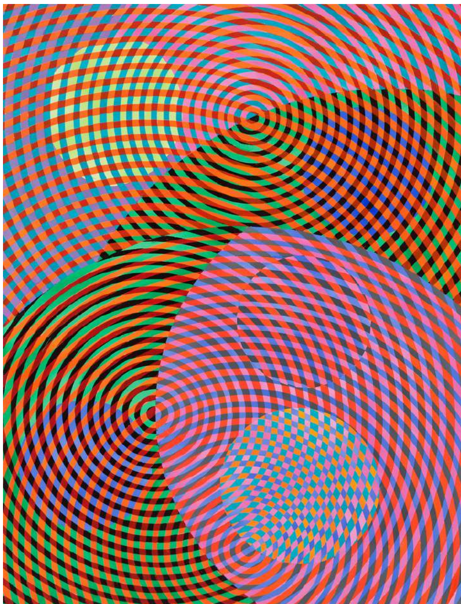
sonic network no. 102 2025 oil and acrylic on canvas 92 x 123 cm