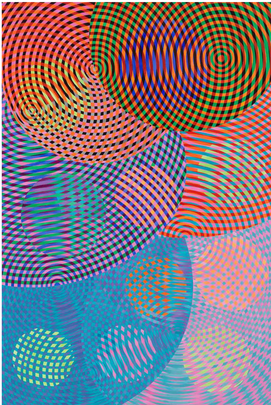
sonic network no. 24 2025 oil and acrylic on canvas 183 x 123 cm