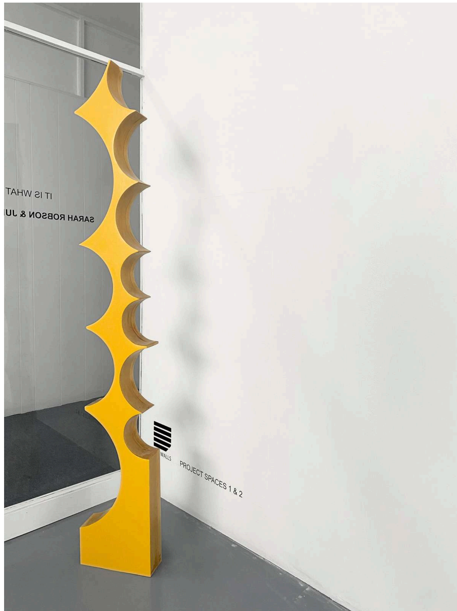
Sarah Robson Untitled sculpture (Remnant), 2025 timber, acrylic paint and polyurethane 182 x 30 x 12cm POA