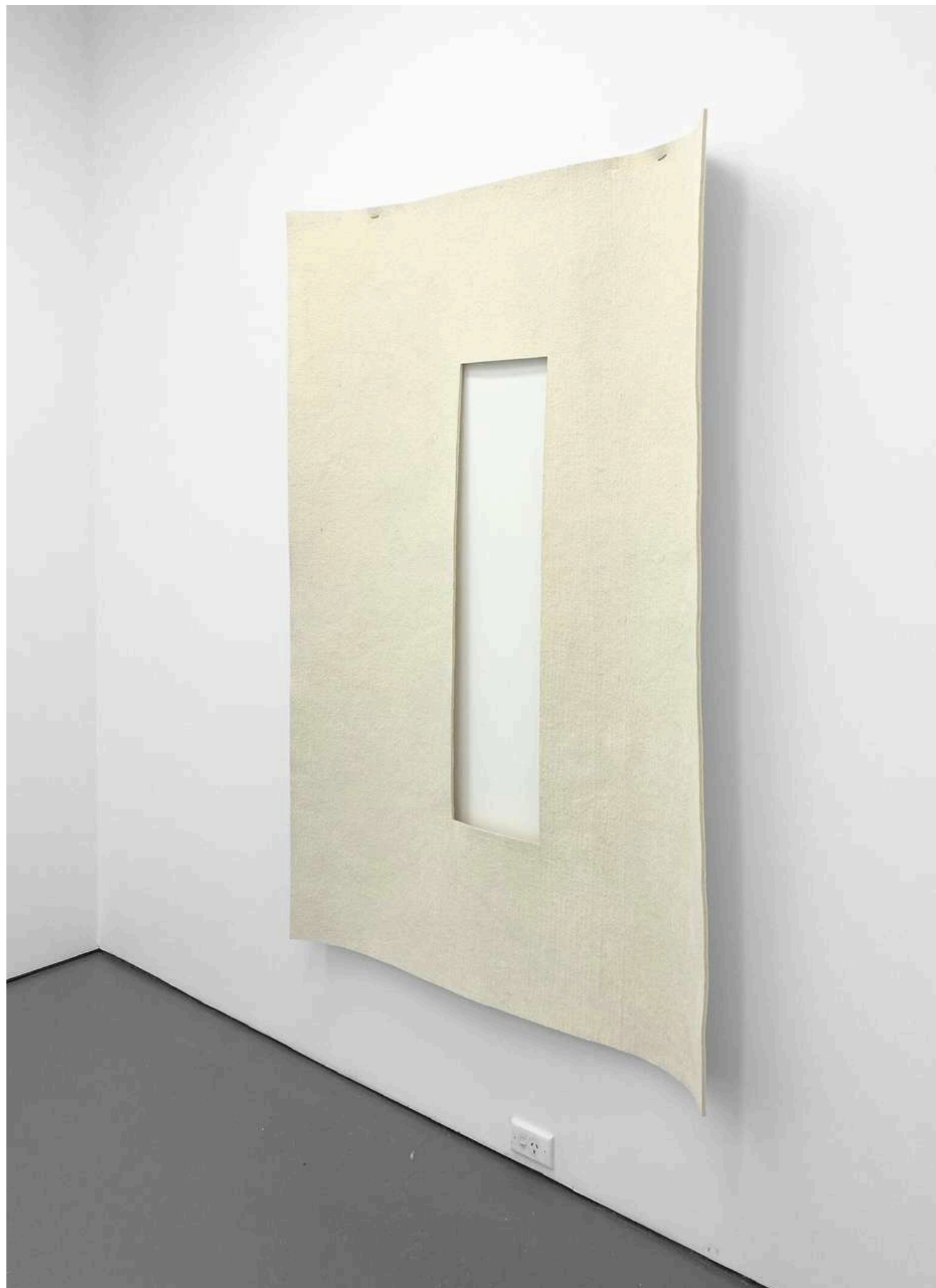
Sarah Robson Untitled Felt Proposition 2025 Industrial felt and acrylic paint 180 x 128 cm NFS